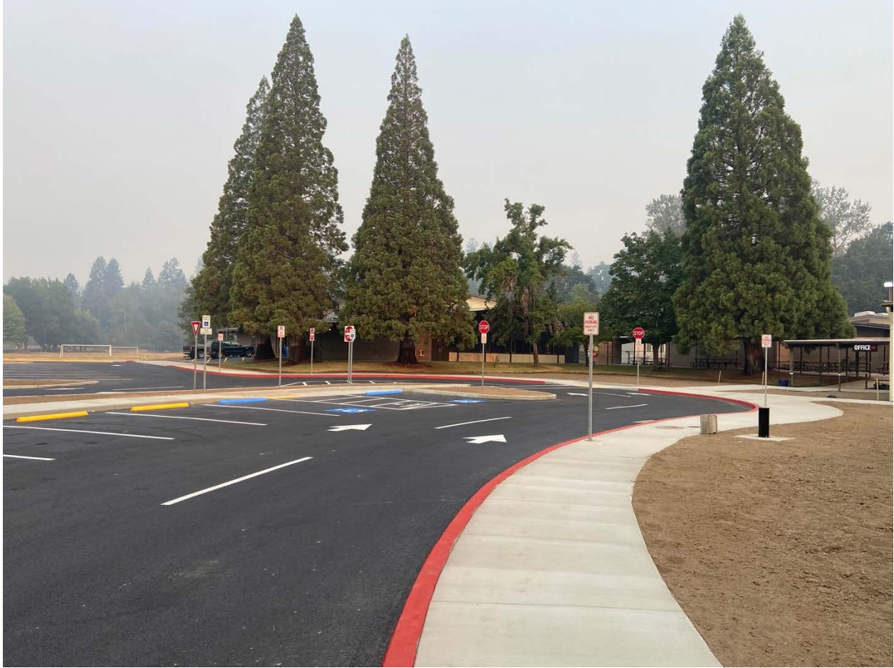
Center drop-off loop