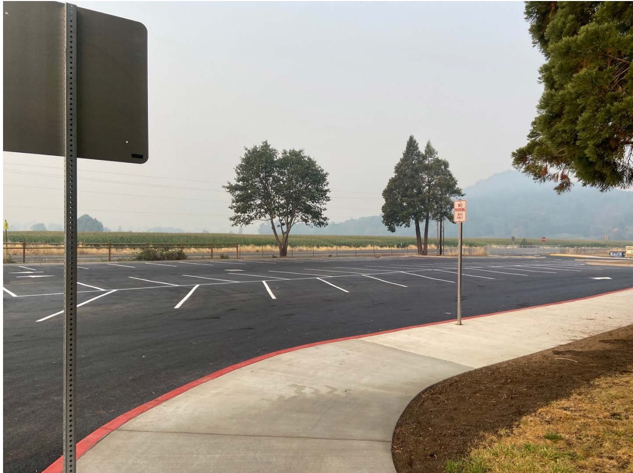
West side of new parking lot