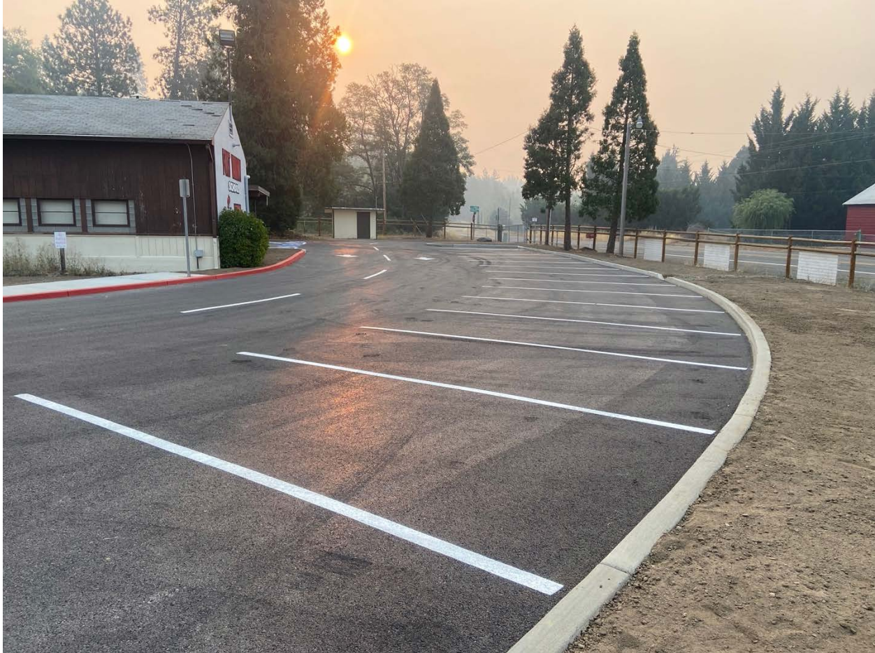
New east parking lot entrance