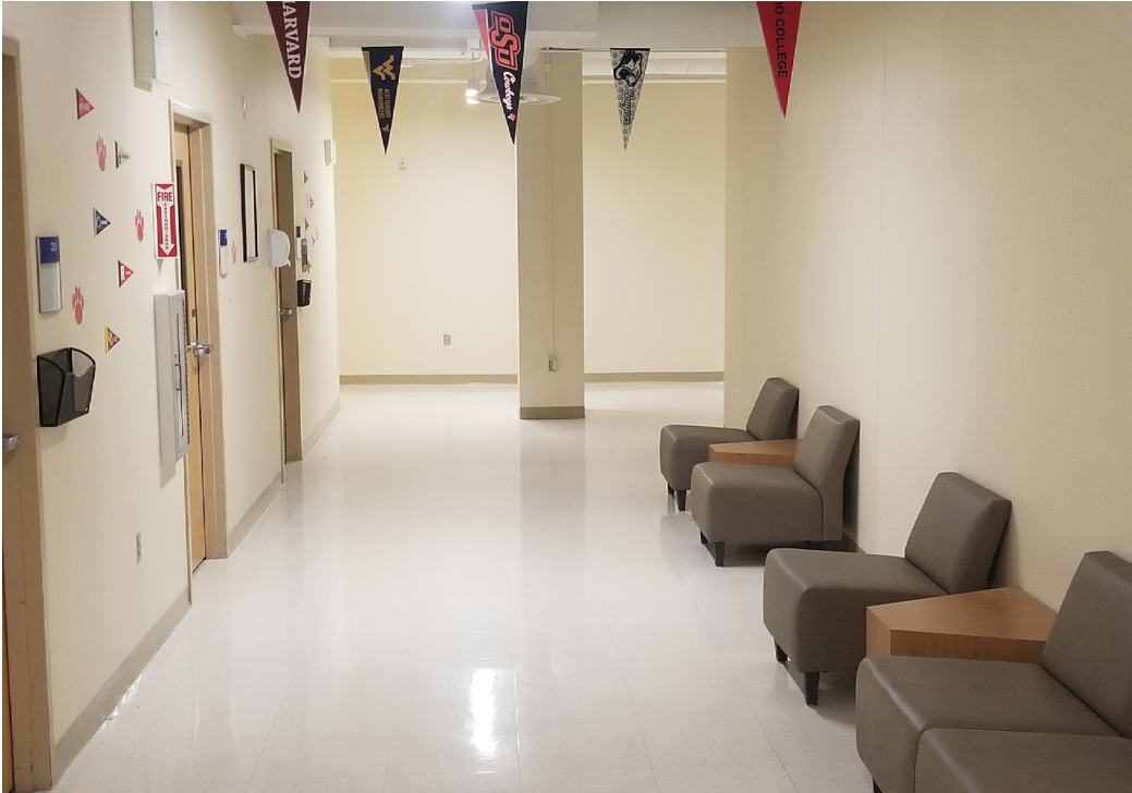
Collaboration Areas around two New Classrooms