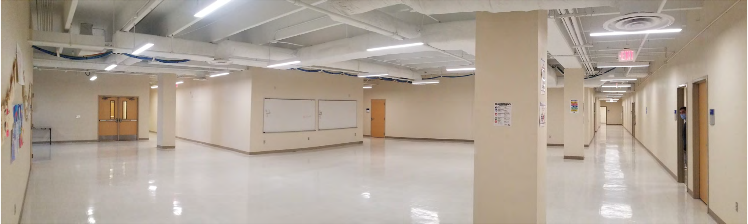
Collaboration Area with New Classrooms on the right