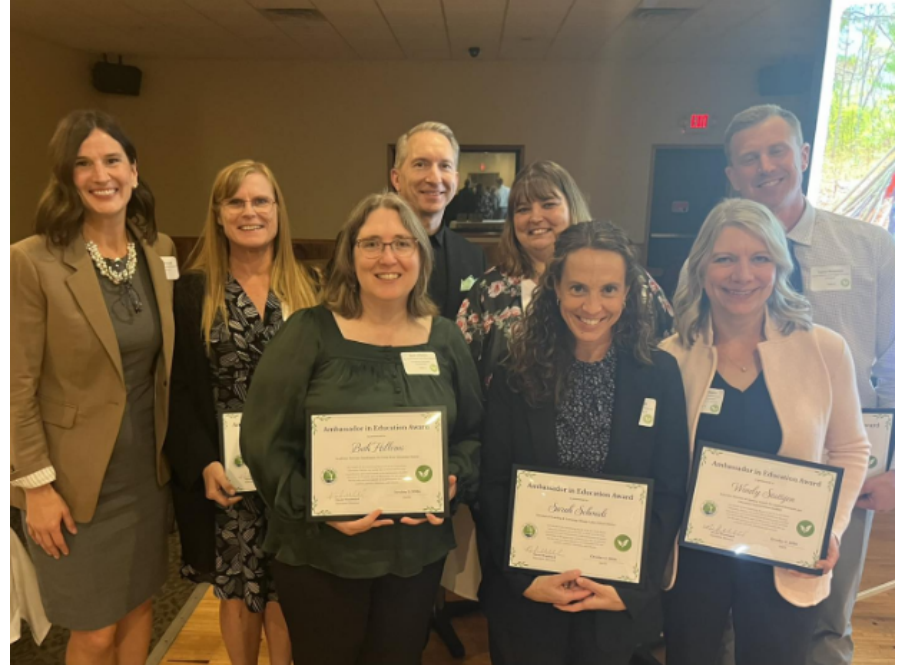
Structured Literacy Implementation Leaders