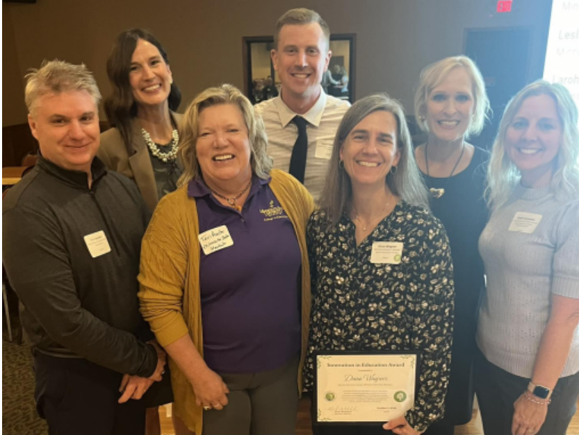
Innovative Workforce Solutions