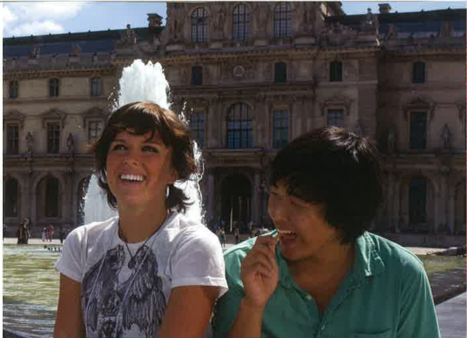
Louvre | Paris, France

Bonjour, Paris! During your sightseeing in the City of Light, get a taste of Parisian style as you ride down the Champs-Élysées, an elegant boulevard packed with high-fashion boutiques. Pass the Place de la Concorde and the Arc de Triomphe and strike a pose in front of the Eiffel Tower. At the École Militaire, see where a promising young Napoleon launched his rise to power. I.M. Pei's iconic glass pyramid marks the entrance to the renowned Louvre, home to treasures like Leonardo da Vinci's Mona Lisa . Then, travel to the Notre Dame Cathedral and admire its sculptured façade, stained-glass rose windows and seemingly weightless vaulted ceilings.