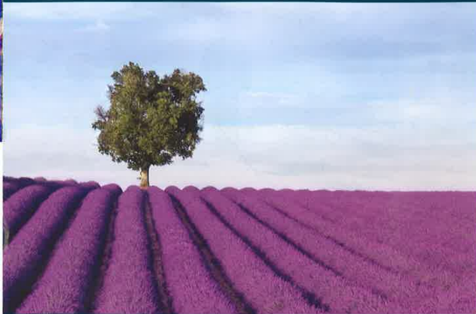
Lavender field | Provence, France