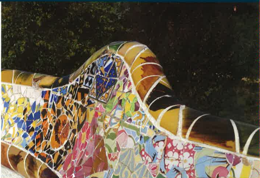
Park Güell | Barcelona, Spain

See why Barcelona is an art lover's dream city and the place where masters like Miró, Picasso and Dalí flourished. On your sightseeing tour, explore open-air plazas dotted with avant-garde gems, like the Plaza de Catalunya and Plaza España. Snap photos of the twisting spires of La Sagrada Família and the Magic Fountain of Montjuïc, which delights with dazzling light and water shows. From atop Montjuïc Hill enjoy panoramic views of the harbor below. Here you'll also find the 1992 Olympic stadium. Marvel at the landscaped greenery and playful Modernist mosaics on your visit to Park Güell. Flower vendors and street performers greet you on your walking tour of the tree-lined Las Ramblas.