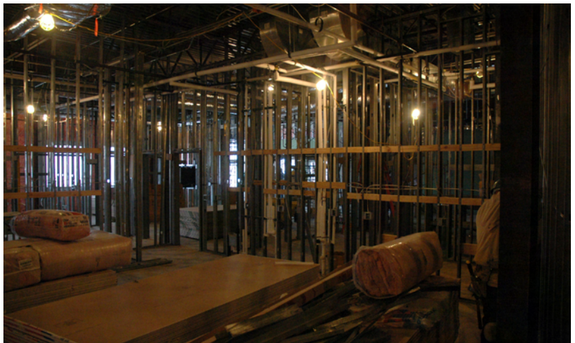
Area A - Classroom Wall Framing