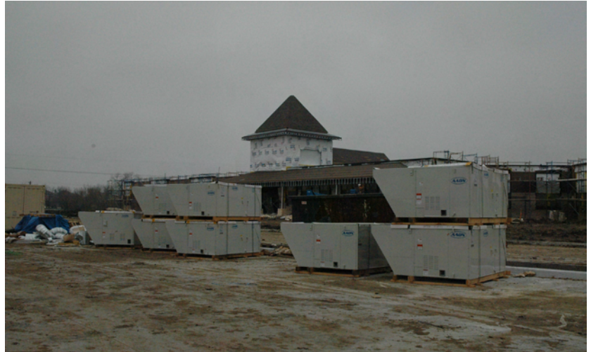
Main Entry from Parking Lot