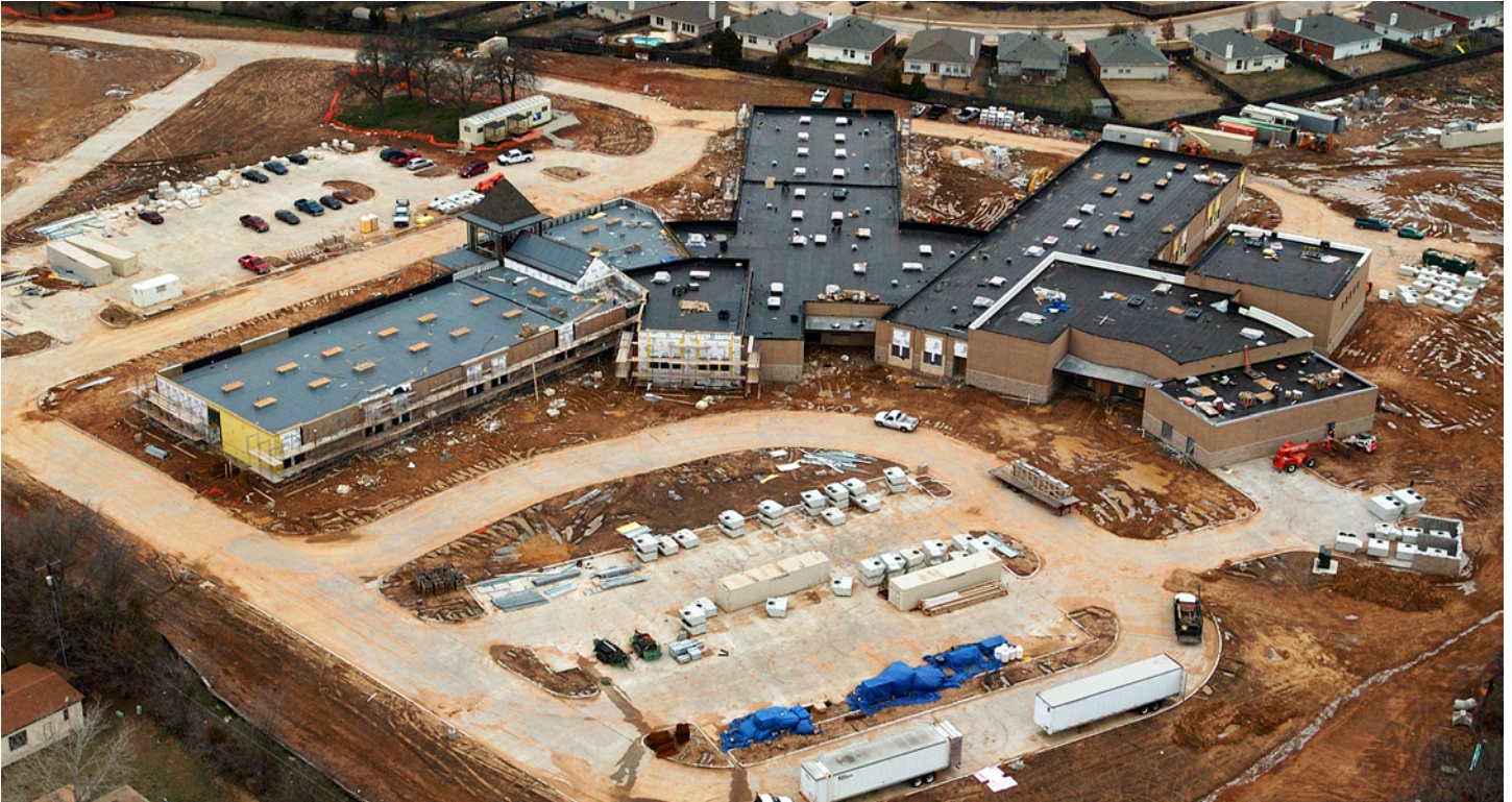
Aerial view of site