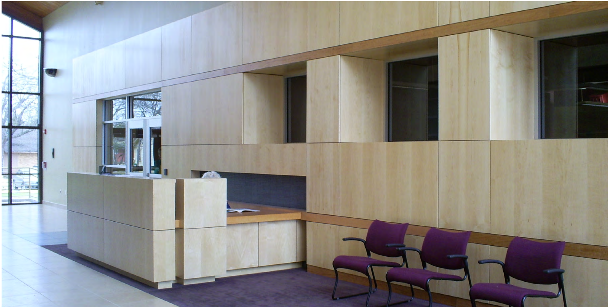
Reception Desk and Lobby Waiting Area