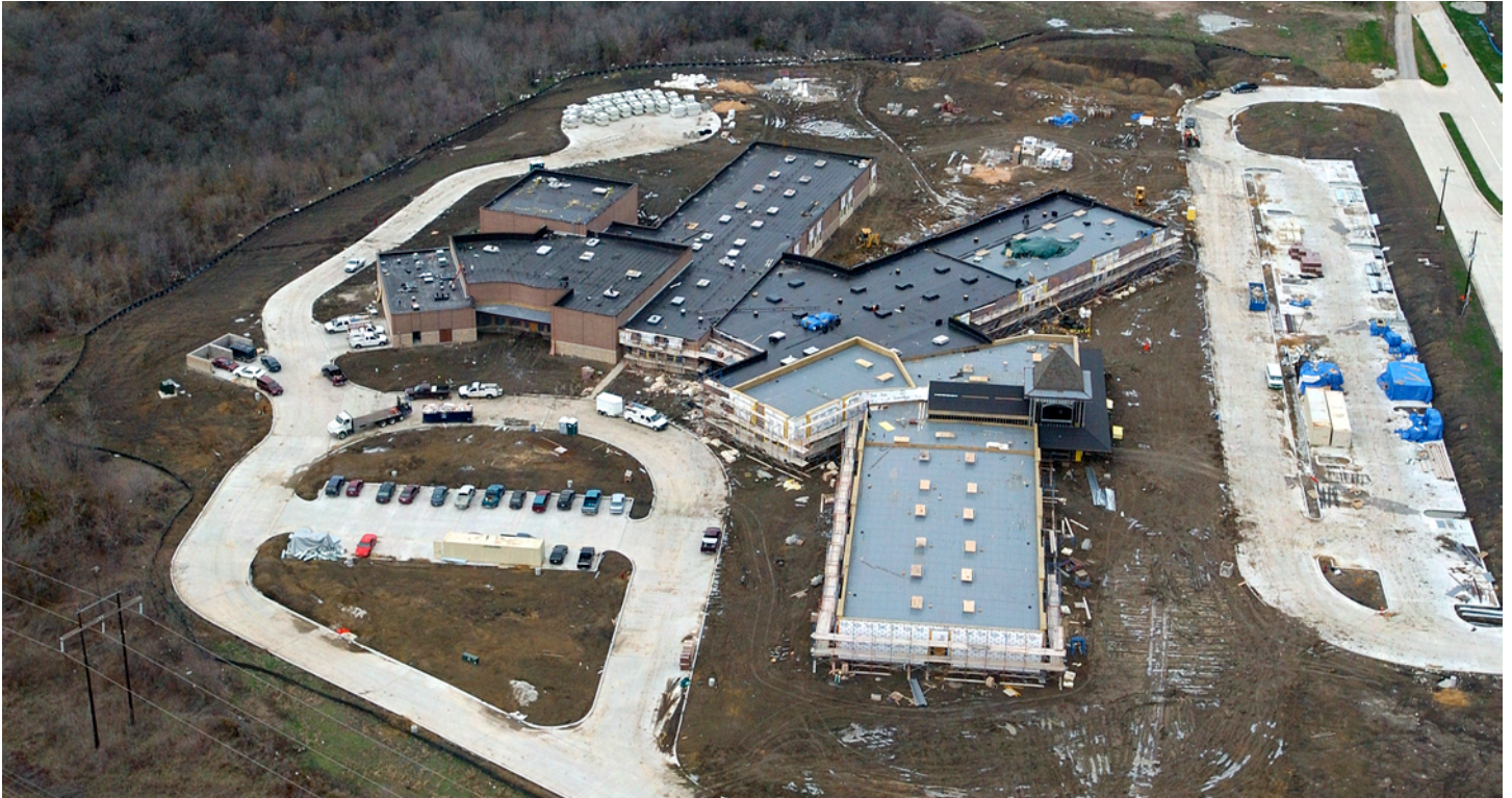
Aerial view of site