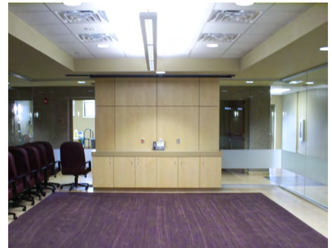
Seminar Rooms and Conference Room