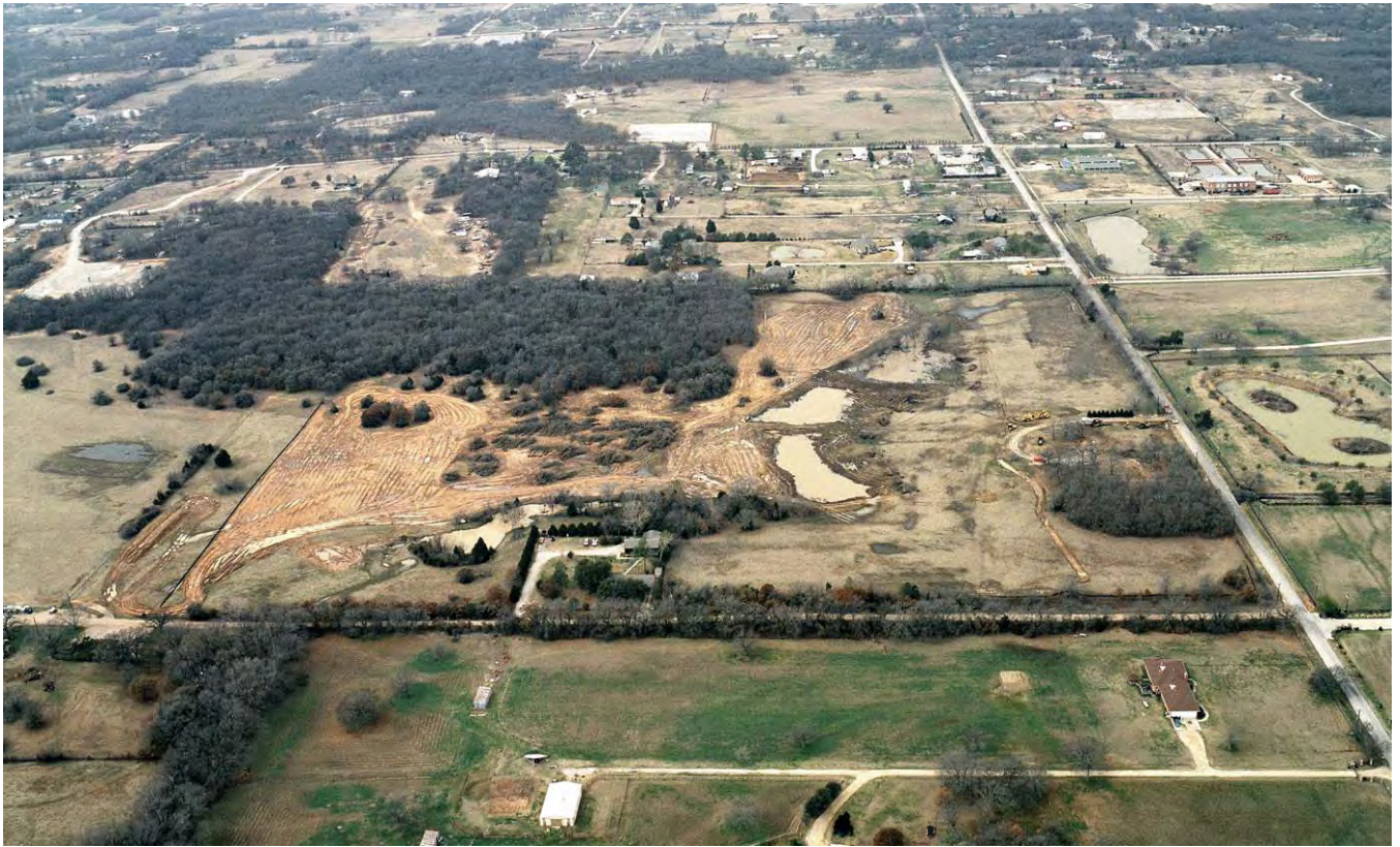
Aerial View - January 29, 2007