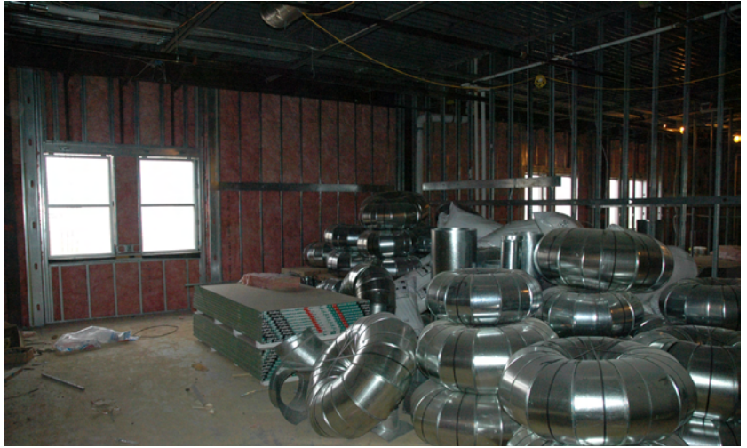
Area A Classroom