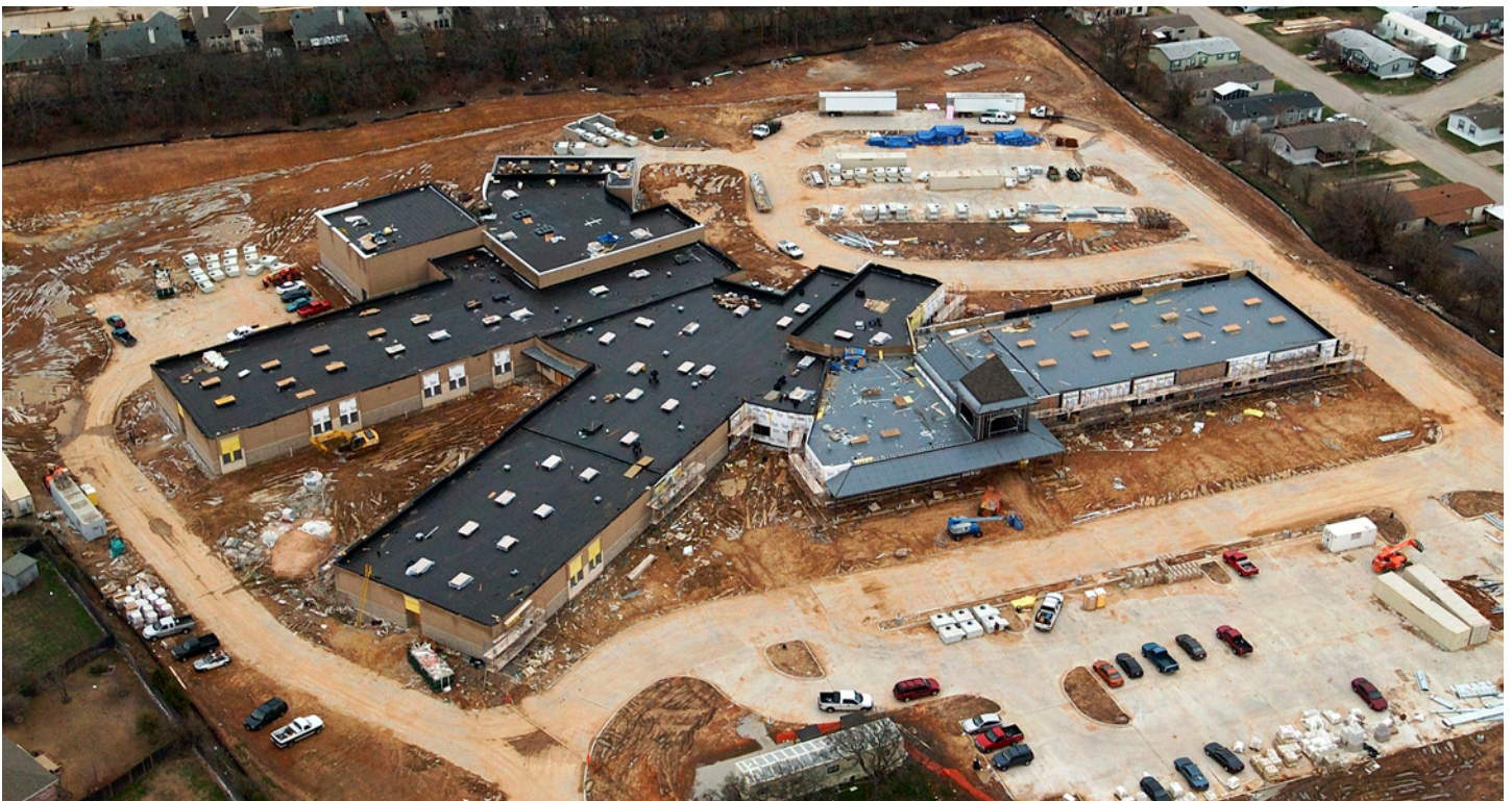
Aerial view of site