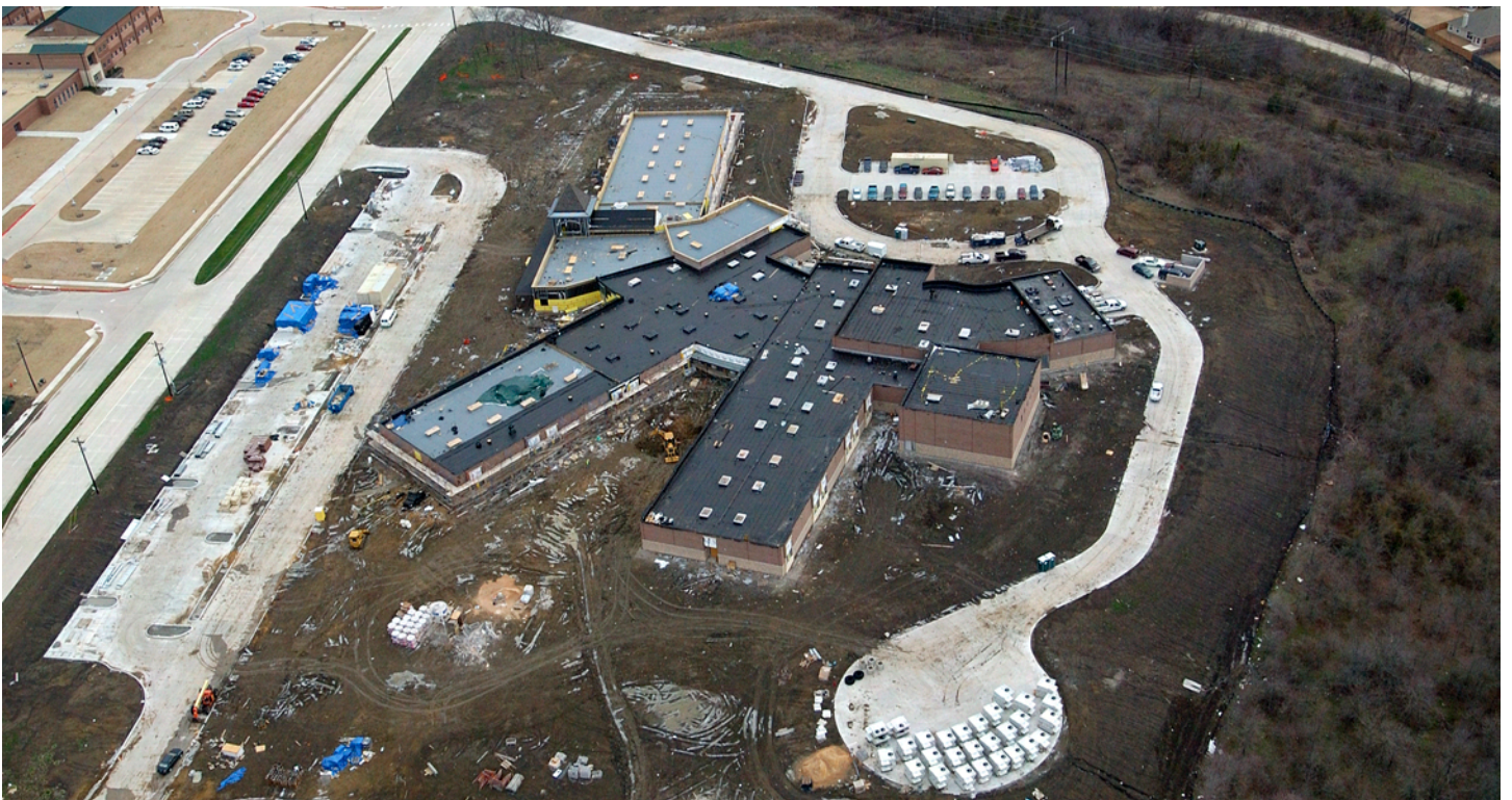
Aerial view of site