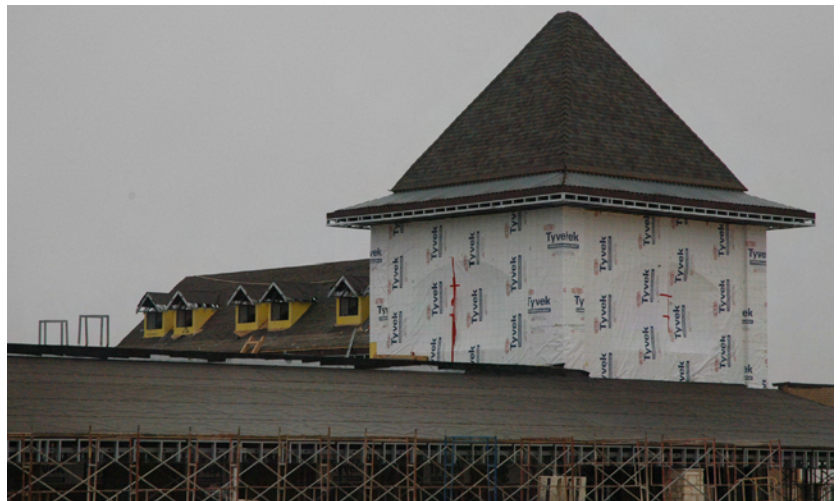
Main Entry Dormers