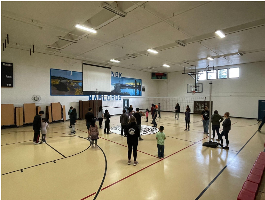
Yupik Dance class with Igiugig over Zoom.