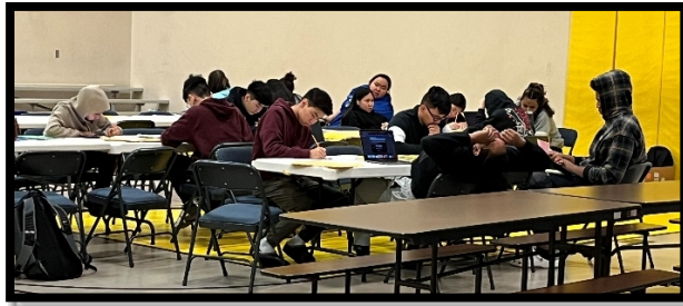
Visiting teams studied and completed assignments during the day before competing in their basketball games.