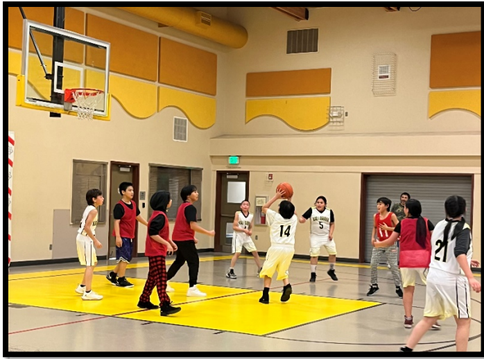
Middle school students competed multiple times throughout their season at school events.