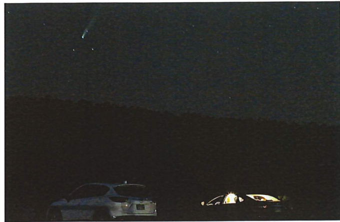
Cars are parked in the Natural Steps community as people watch the comet NEOWISE in the sky late Saturday night. The comet will come closest to Earth on Wednesday and can be seen nightly in the northwestern sky about 90 minutes after sunset.