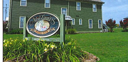
Miss Laura's Visitor Center, where the offices of the Fort Smith Convention and Visitors Bureau an located, is shown Friday.