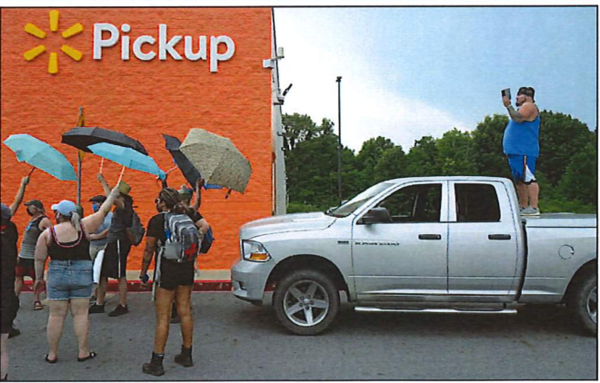
Demonstrators use umbrellas to block a man's view as he tries to get video of their protest Sunday outside the Walmart Neighborhood Market in Sherwood. More photos at arkansasonline.com/76walmart/.

the road to a Walmart Neigh-borhood Market, where the demonstration began again.