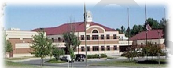
Granby Memorial Middle School Grades 6-8 Enrollment: 446