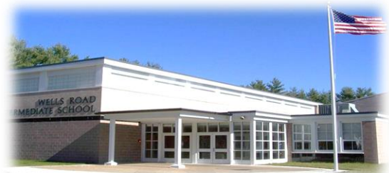
Wells Road Intermediate School Grades 3-5 Enrollment: 360