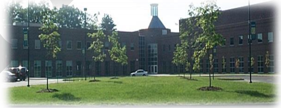
Granby Memorial High School Grades 9-12 Enrollment: 569