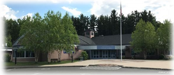
Kelly Lane Primary School Grades PK-2 Enrollment: 371