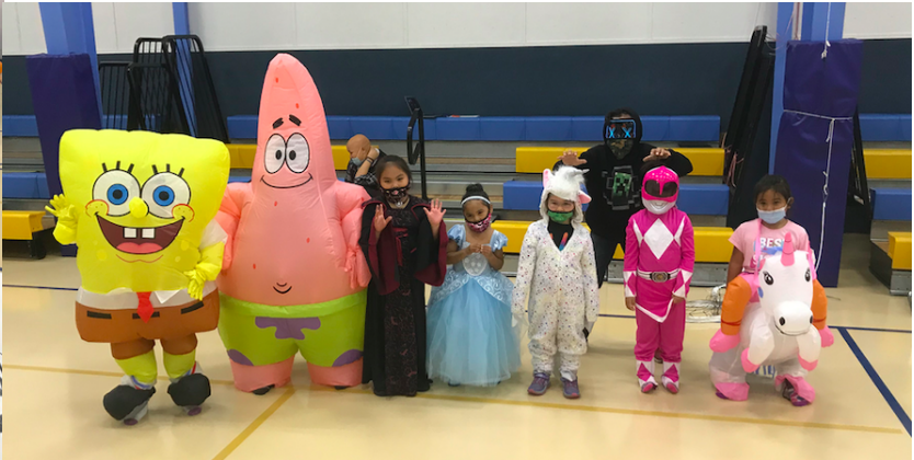
The costume contestants