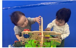
EARLY CHILDHOOD LEARNING CENTER