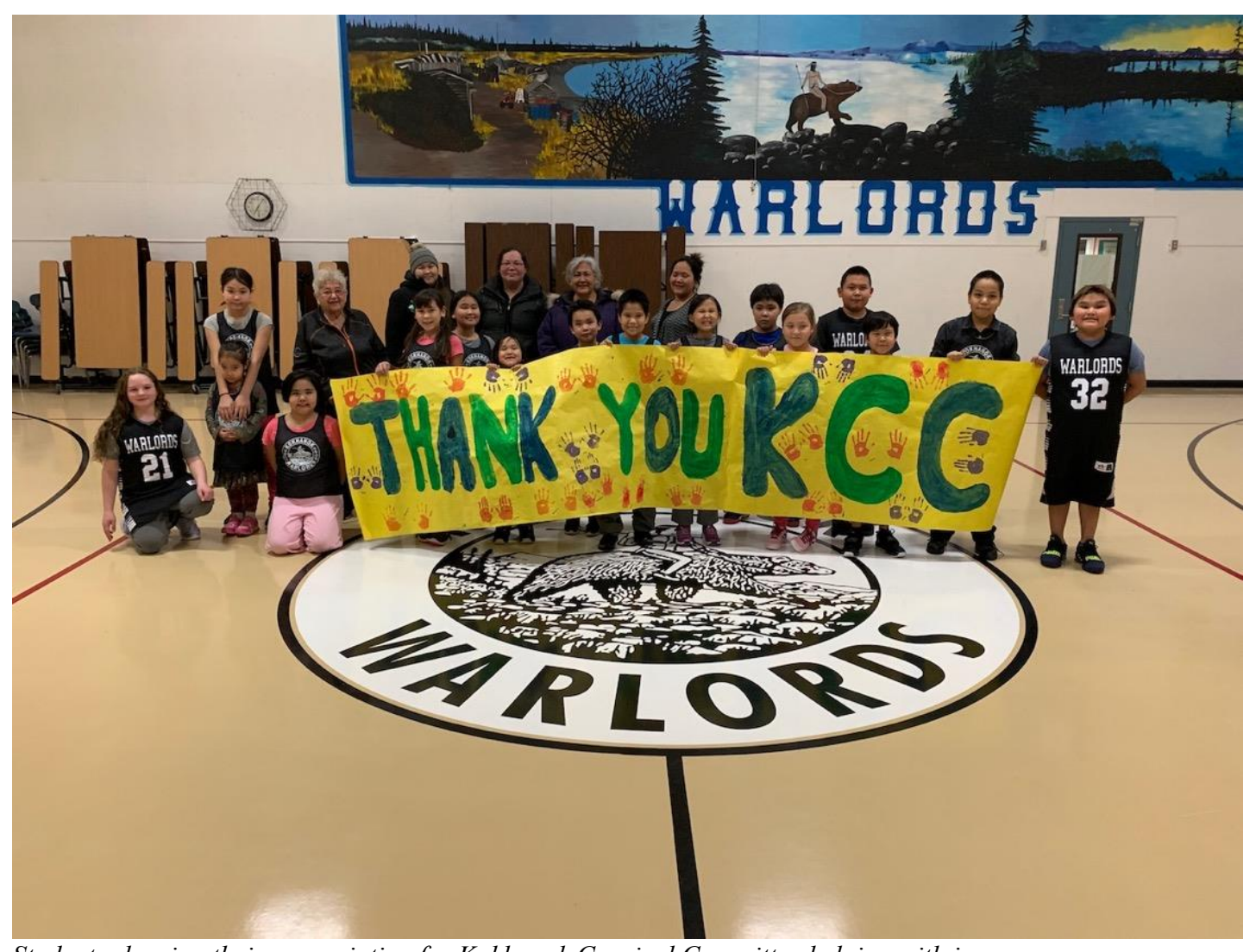
Students showing their appreciation for Kokhanok Carnival Committee helping with jerseys.