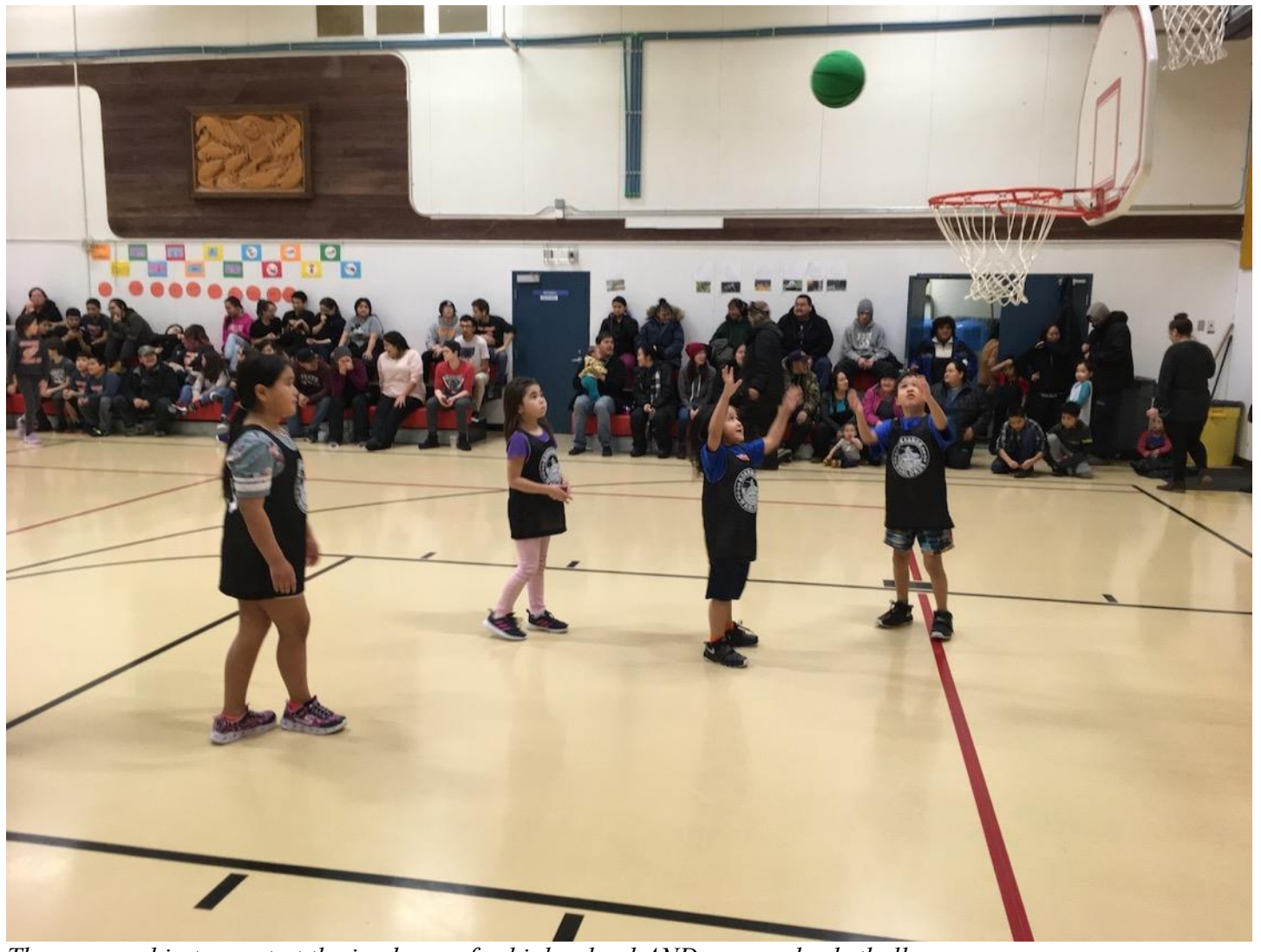
There was a big turnout at the jamboree, for high school AND peewee basketball.