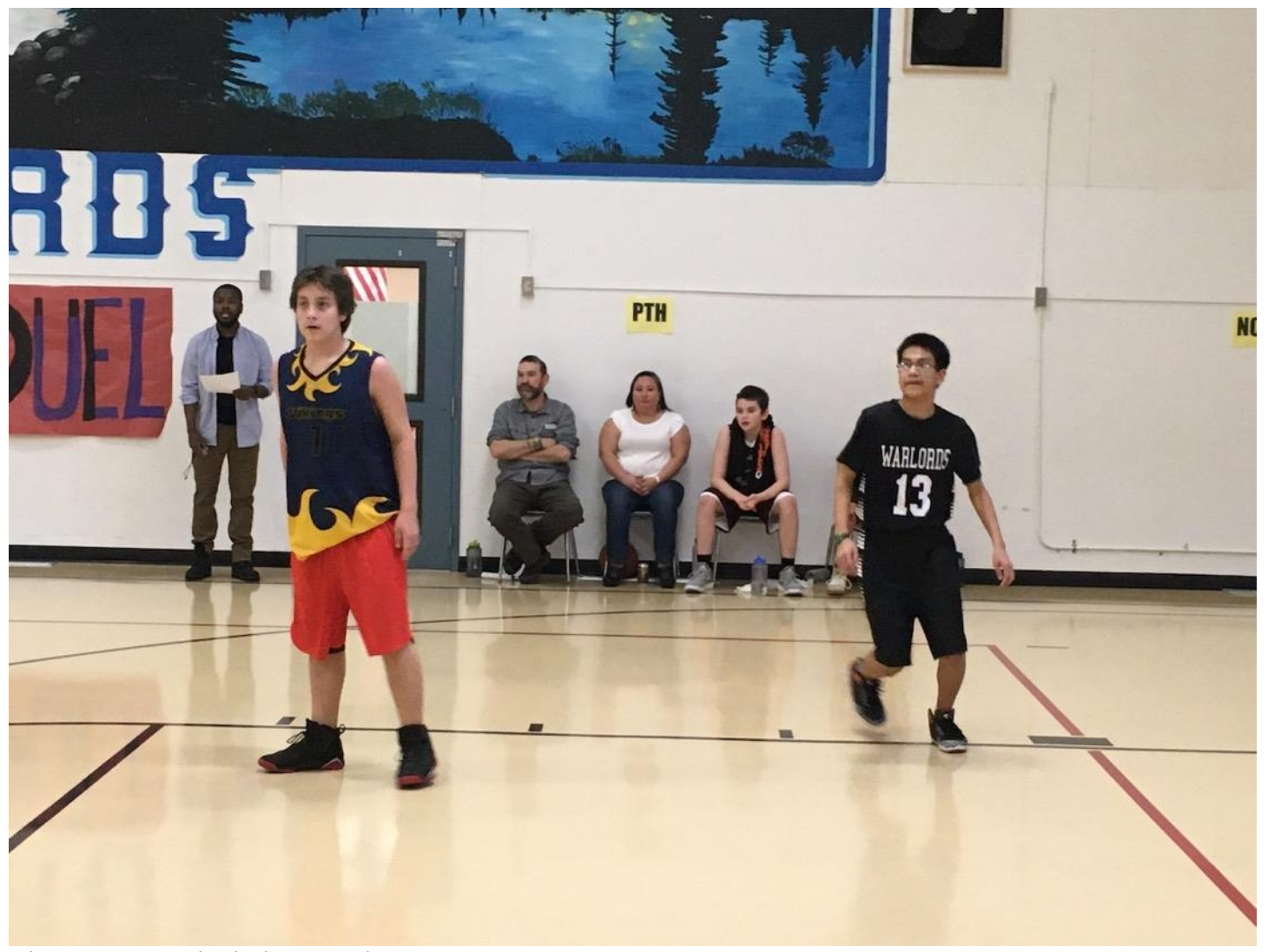
The new jerseys look sharp on the court!