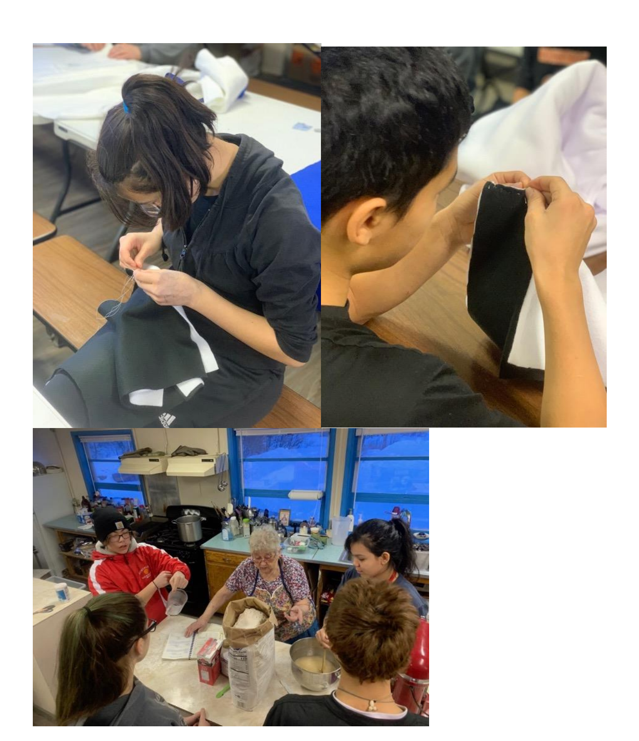
We made fry bread for elders in the community, and facemasks for those in need in Anchorage, as service projects during the jamboree. The students were so engaged!