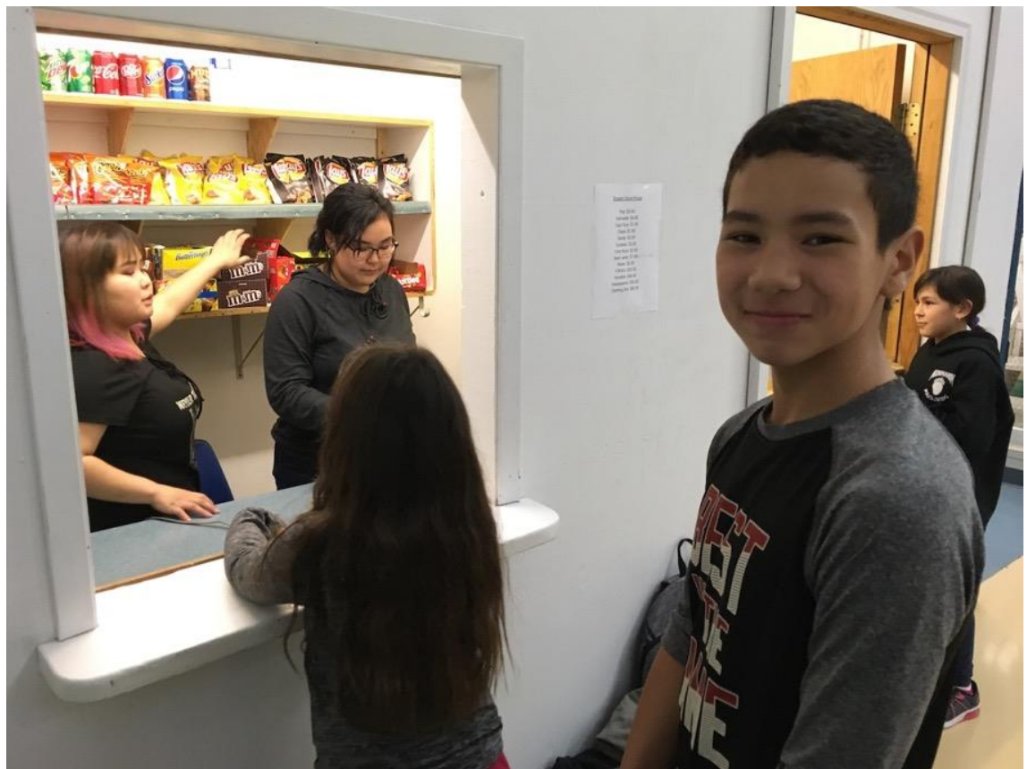
Kokhanok student government made sure the student store was well stocked for the jamboree.