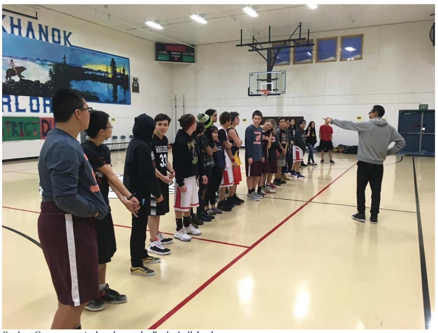
Student Government icebreaker at the Basketball Jamboree