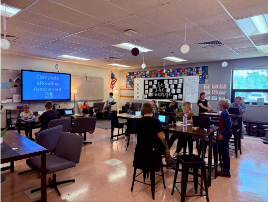
Bridges Math in K