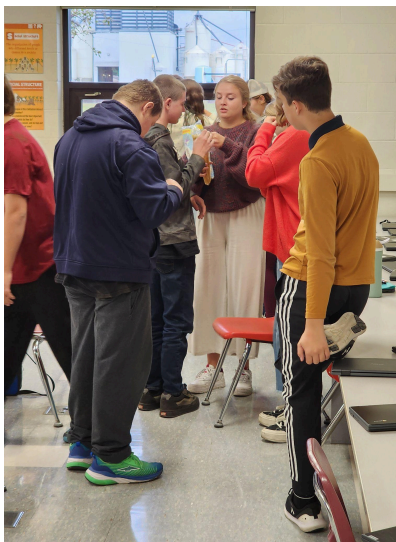
AVID focus on Teamwork in