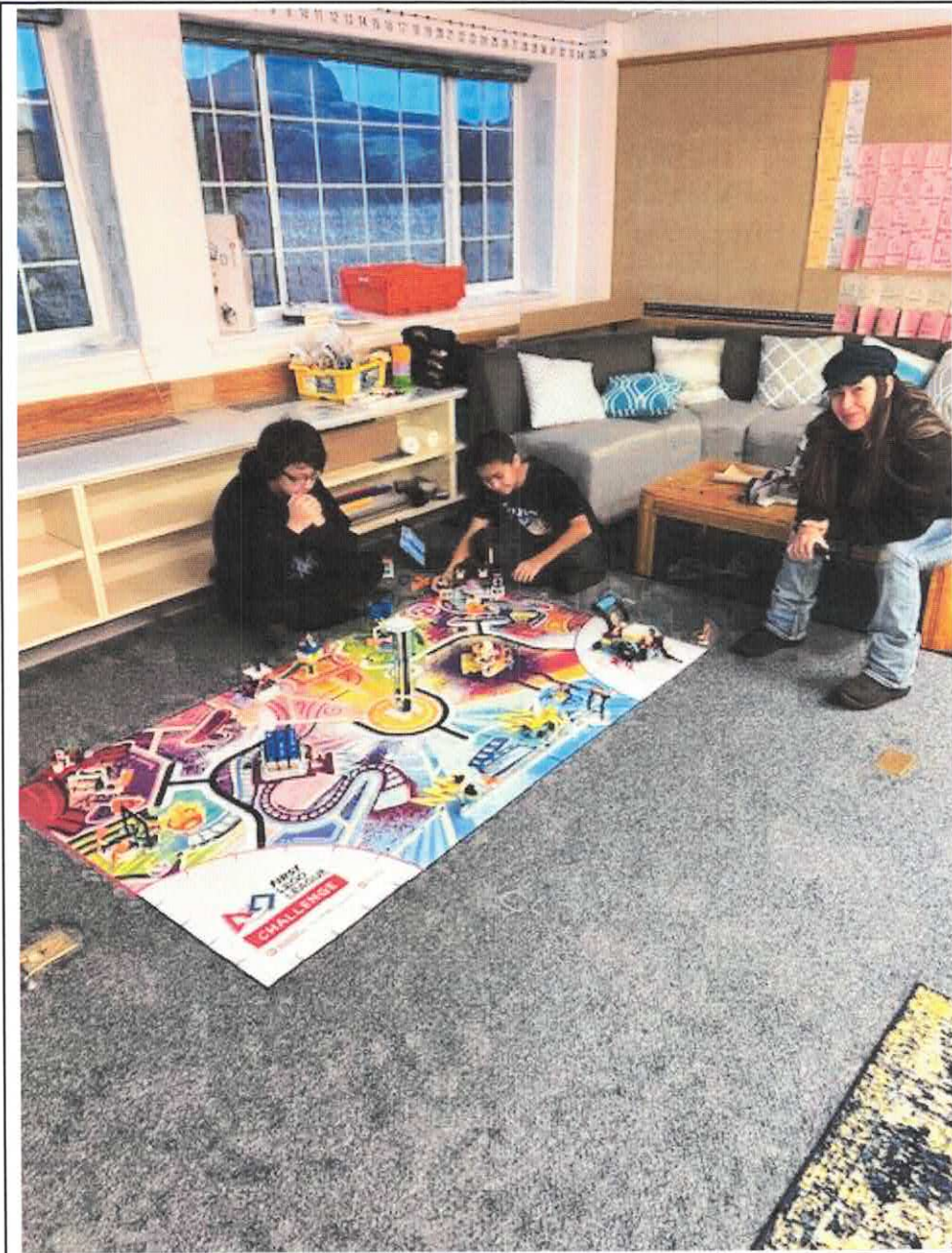
wonderful job a