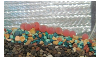
Photo of our eggs.

Mid-Rogue Anglers for letting us borrow a new pump and giving us extra gravel.