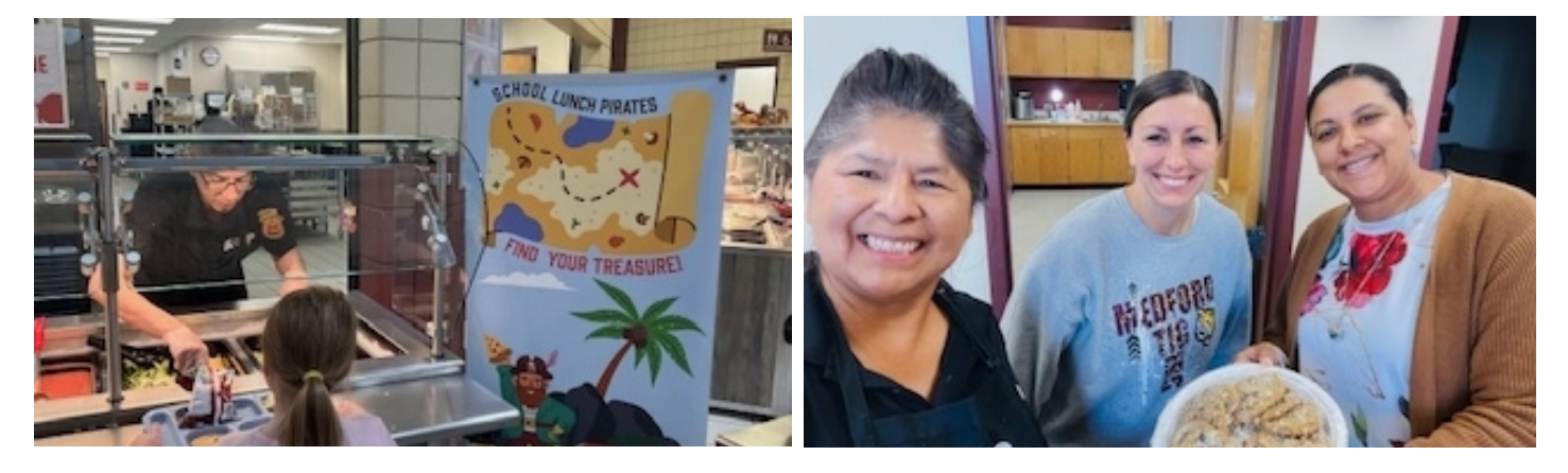
National School Lunch Week was a short week for students in Minnesota, so we had to make the most of our 2 days