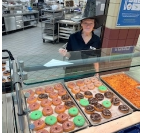
We also made up some spooky donuts for Halloween. The green ones were the student's favorite of course.