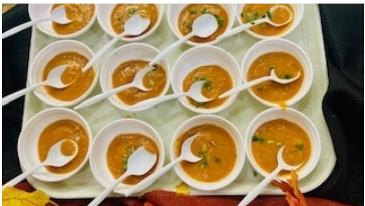
Pumpkin soup, we gave out 165 samples.