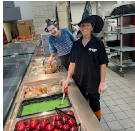
Our two best trick or treaters showed up ready to serve up some fun and smiles with green applesauce at lunch on Halloween.