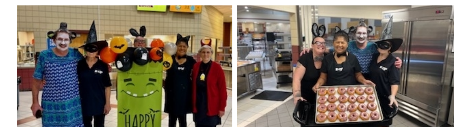
Kitchen Staff ready to service on Halloween