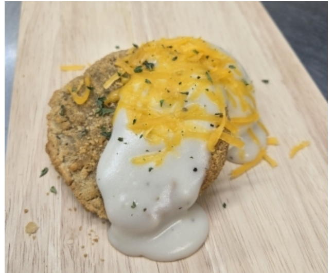
Country Fried Chicken Plate