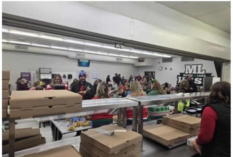
Merry Math Night Pizza Party