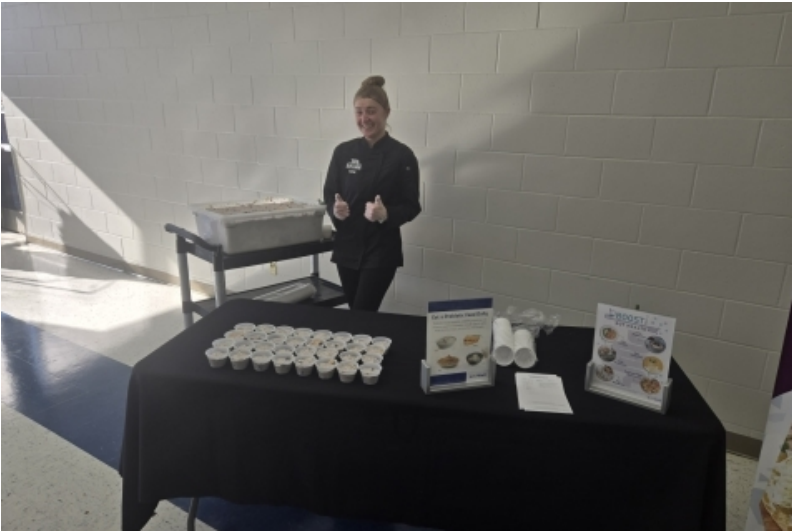
BeWell Blueberry Peach Overnight Oats