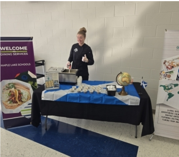
Global Bites Scotland