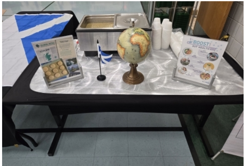
Global Bites Scotland – Scotch Broth