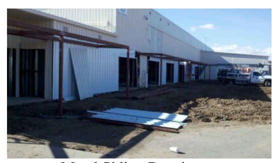
Metal Siding Repairs