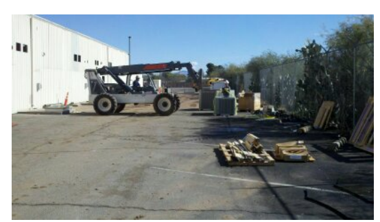
HVAC Unit Placement

MP&E rough—in and framing is complete. Drywall is hung and being finished. Metal siding repairs and site work are in process. Glazing and fence work will be starting soon. Project is on schedule and on budget.