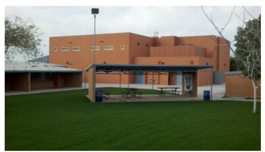
Nash 2 Story Classroom Building and Courtyard Repair

C. <u>Walker Elementary Classroom Addition:</u> Construction is 98% complete. The new two story building is complete and in use. Portables have been removed and the playground is being expanded where the portables used to be. Walker is on schedule and on budget.