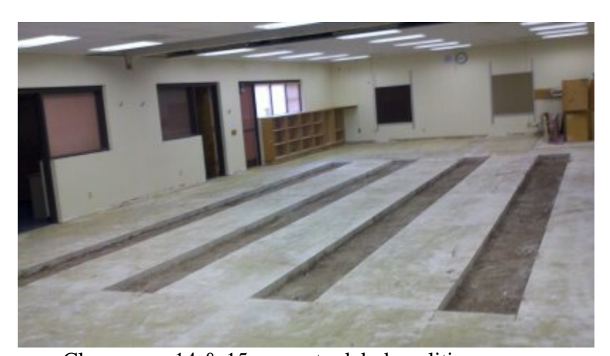
Classrooms 14 & 15 computer lab demolition

F. <u>Copper Creek Classroom Renovation / IT Re-cabling:</u> Construction is 9% complete. Selective demolition has started. The renovation of classrooms 14 & 15 into computer labs has started.