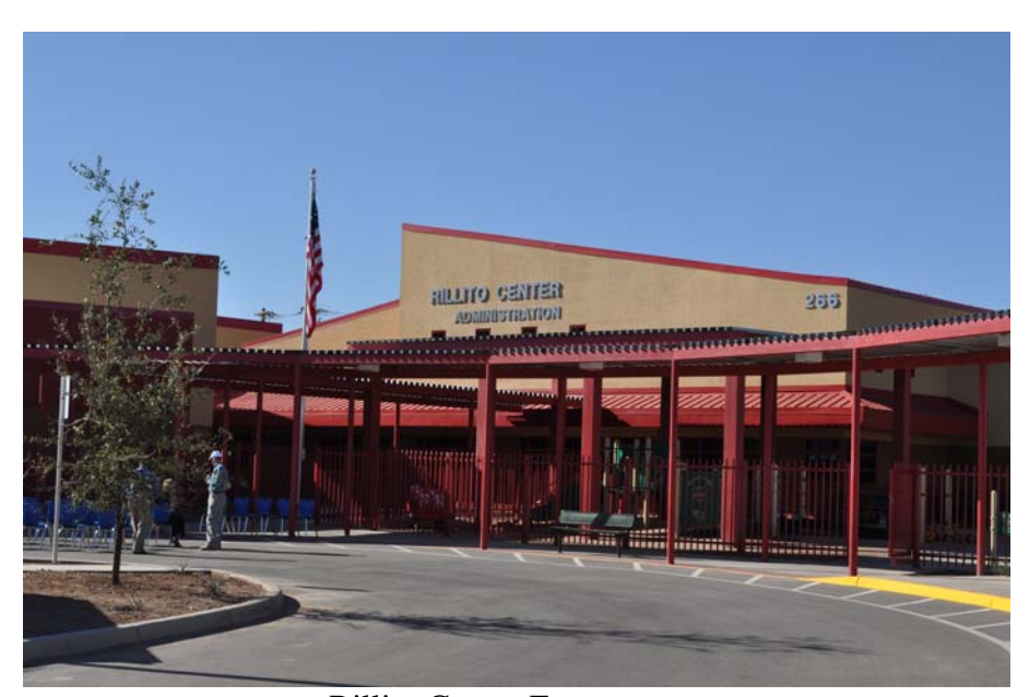
Rillito Center Entrance

A. <u>Rillito Center Addition:</u> Construction is complete. Punch list repairs are being completed and close documentation is in process.