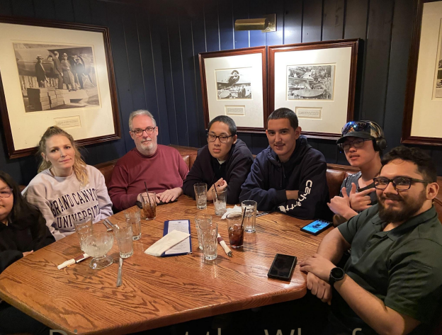
Dinner at the Wharf