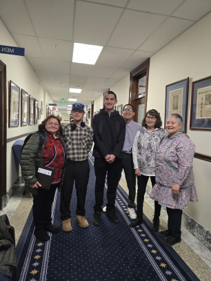
North-West Artic Board