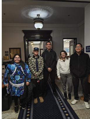
In front of committee hall