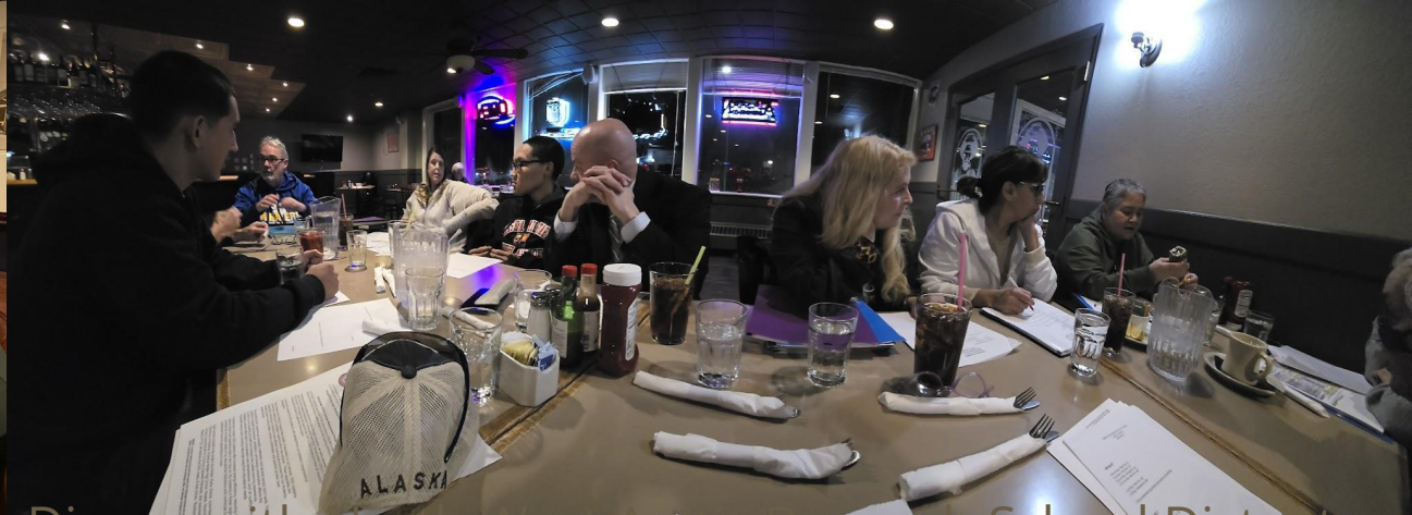
Dinner with North West Arctic Borough School District