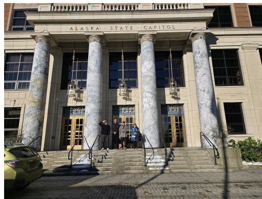
State Capitol Building