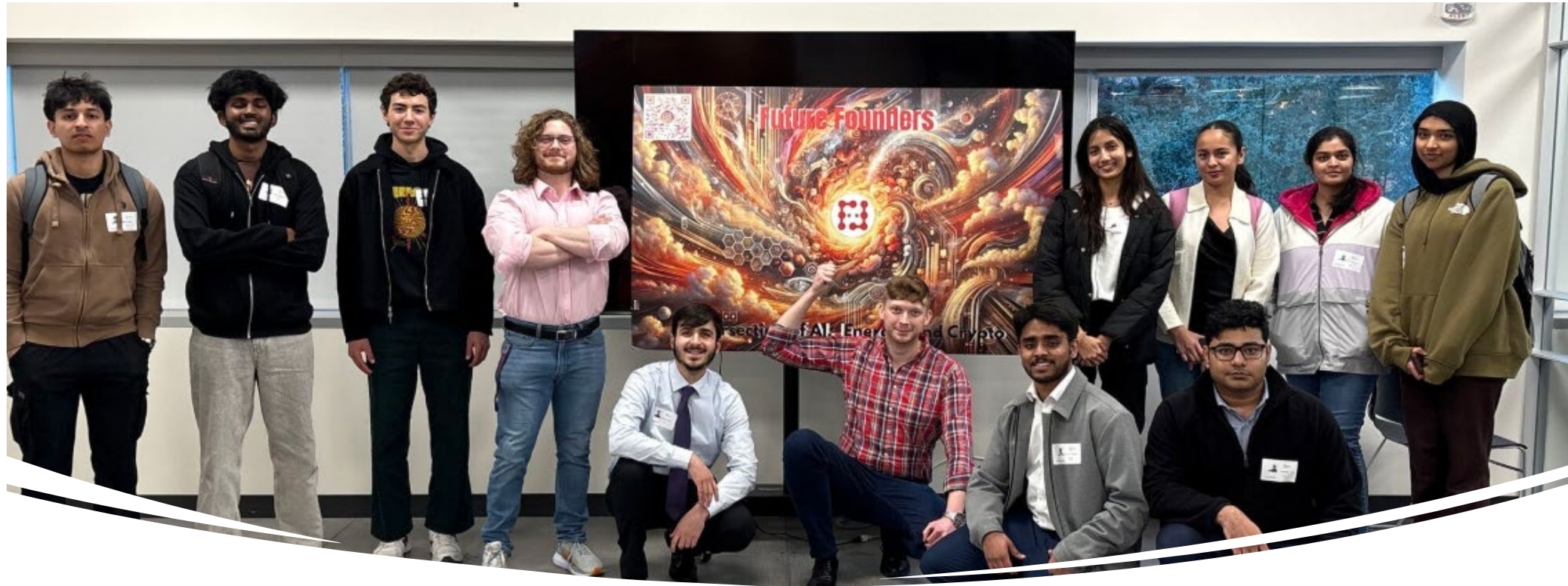
Future Founders student organization