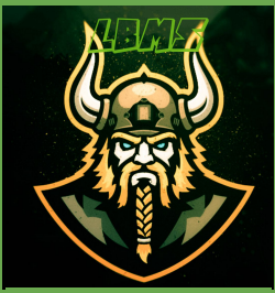
Logo: Denny Choate