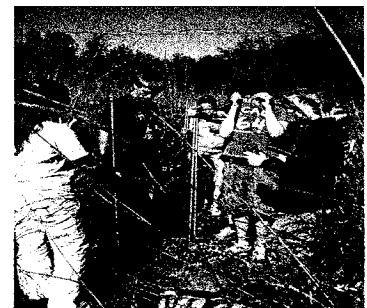
In the Field

This class meets on Tuesdays/ Thursdays from 2:30—4:00. Up to 1 credit can be earned through this