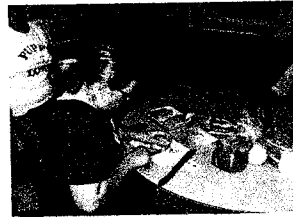
Cooking Club making a Sweet & Sour Chicken Noodle dish

Credit Recovery—Education 2020 is a virtual classroom that offers the opportunity to complete needed courses with