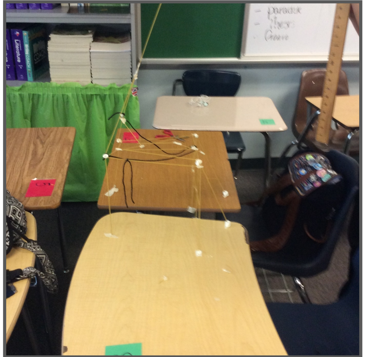
Team building project learned at the Circle R

93% remaining in the program since August, 2015