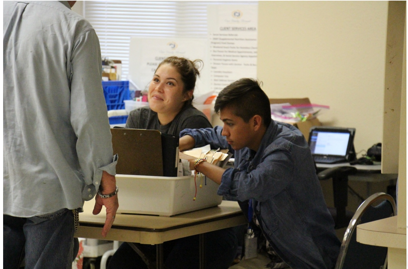
Student Assisting at Daily Bread

9 African-American 6 Caucasian 24 Hispanic 20 E. L. L.