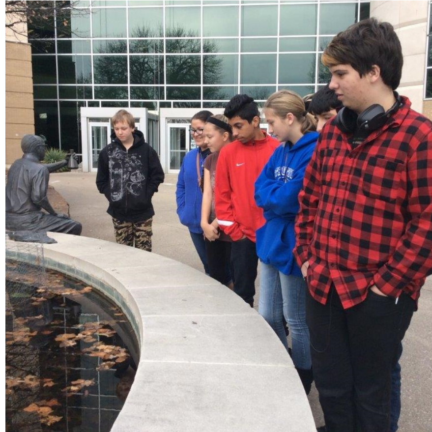
Students visiting U.N.T.'s Environmental Science Building