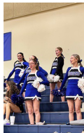
Cheer Always supporting the Cougars