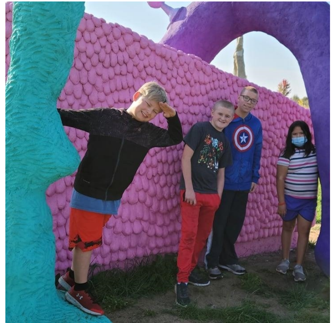
Kinship Kinskids explored Franconia Sculpture Park. October 2021

It all starts with a referral. Referrals can come from teachers, families, friends, counselors, & churches and can be 100% anonymous. Just reach out to our office and we'll take it from there.