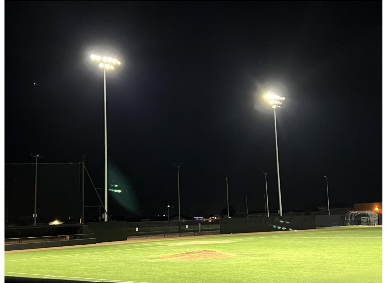
Permian High School