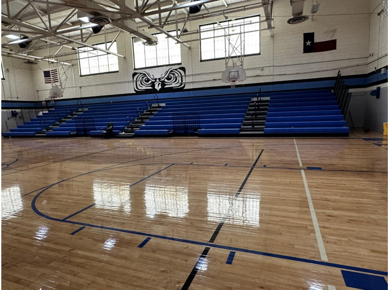
Bonham Middle School