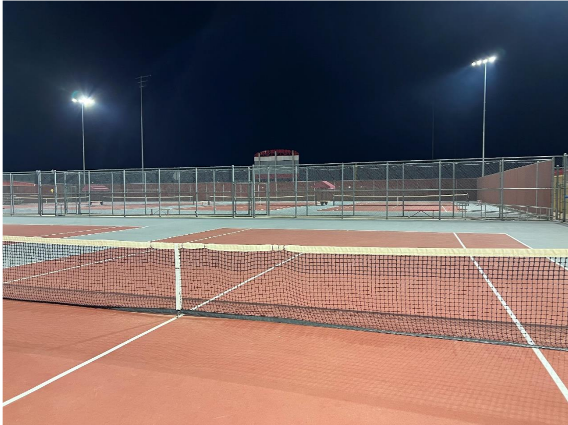
Odessa High School