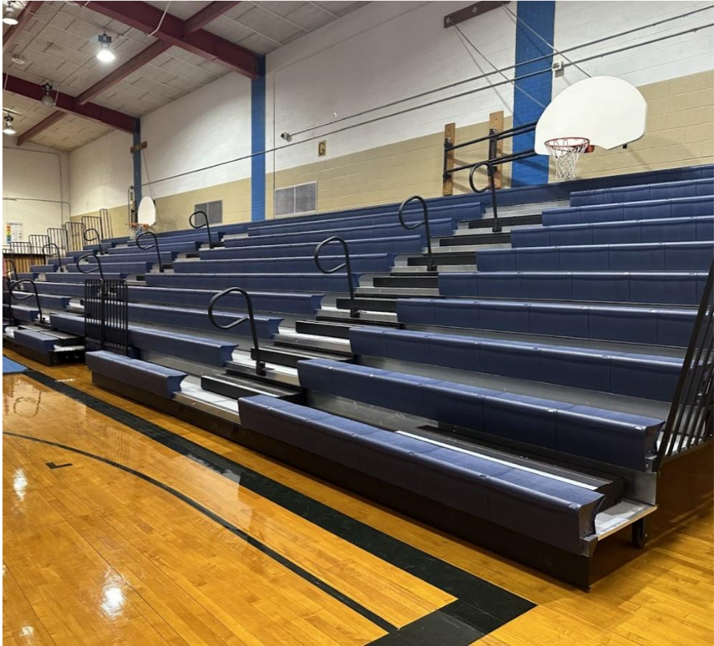
Nimitz Middle School