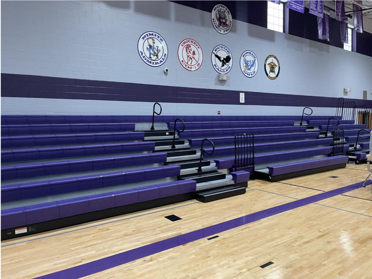
Bowie Middle School