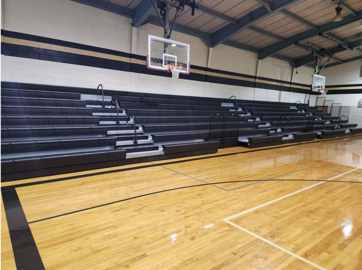
Wilson & Young Middle School