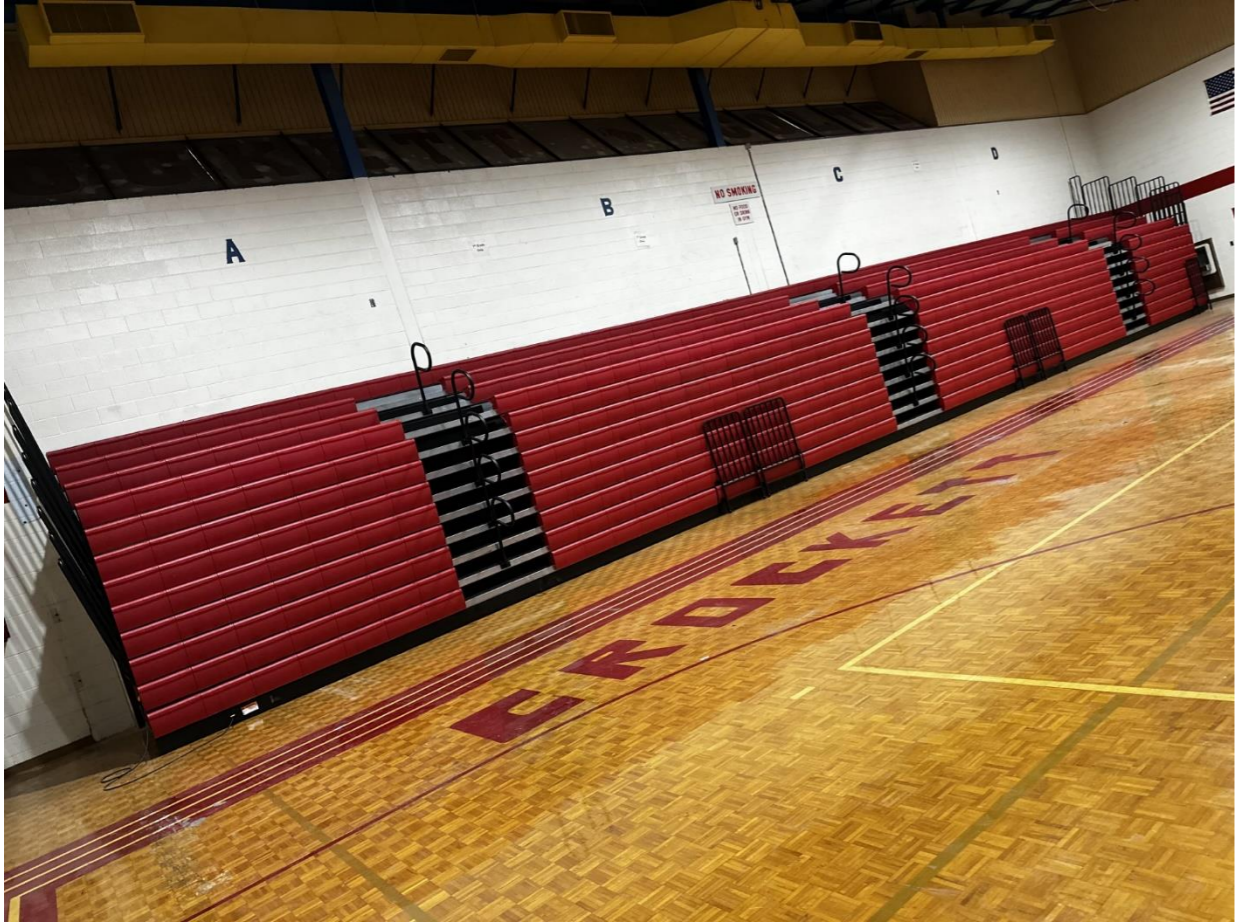
Crockett Middle School