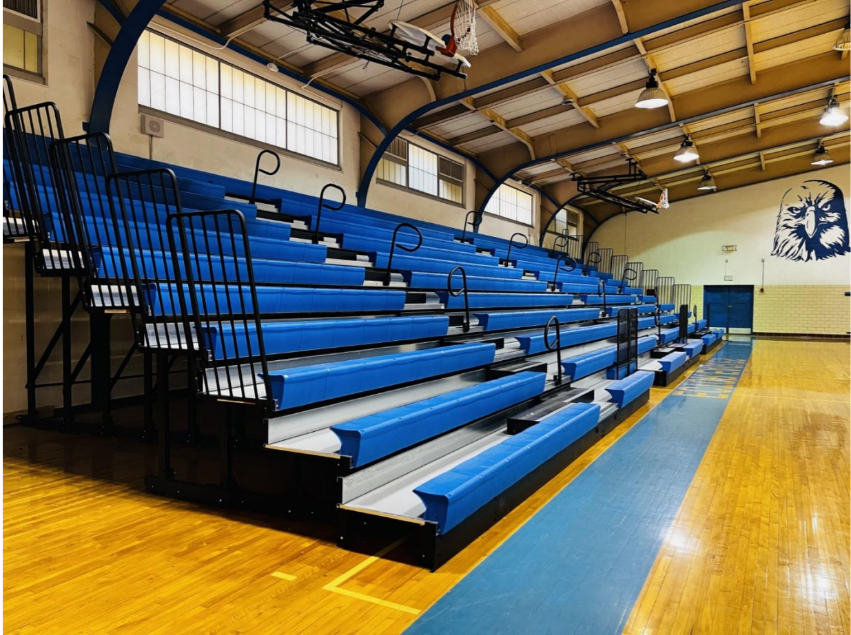
Ector Middle School