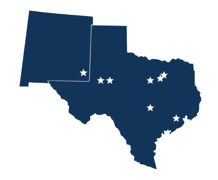
Austin | Dallas | Fort Worth | Hobbs | Houston | Midland | Odessa | Plano