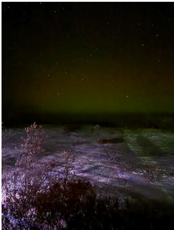
Clear evening with a faint glimpse of the Northern lights