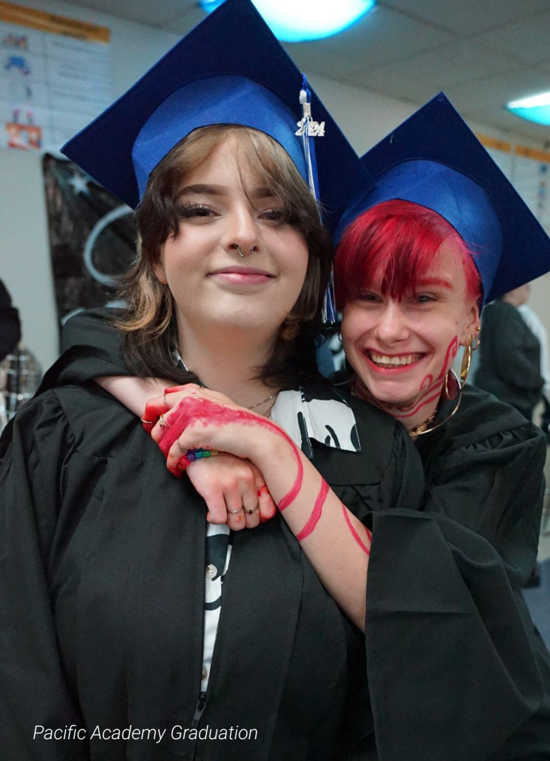
Pacific Academy Graduation