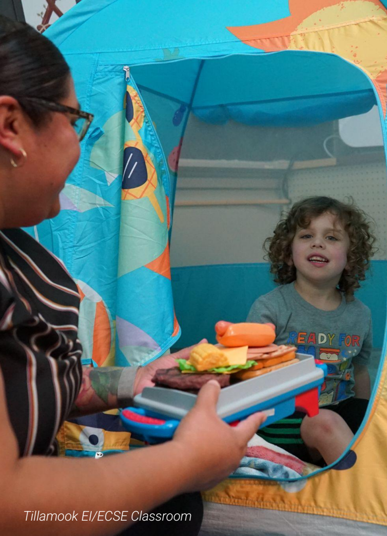
Tillamook EI/ECSE Classroom