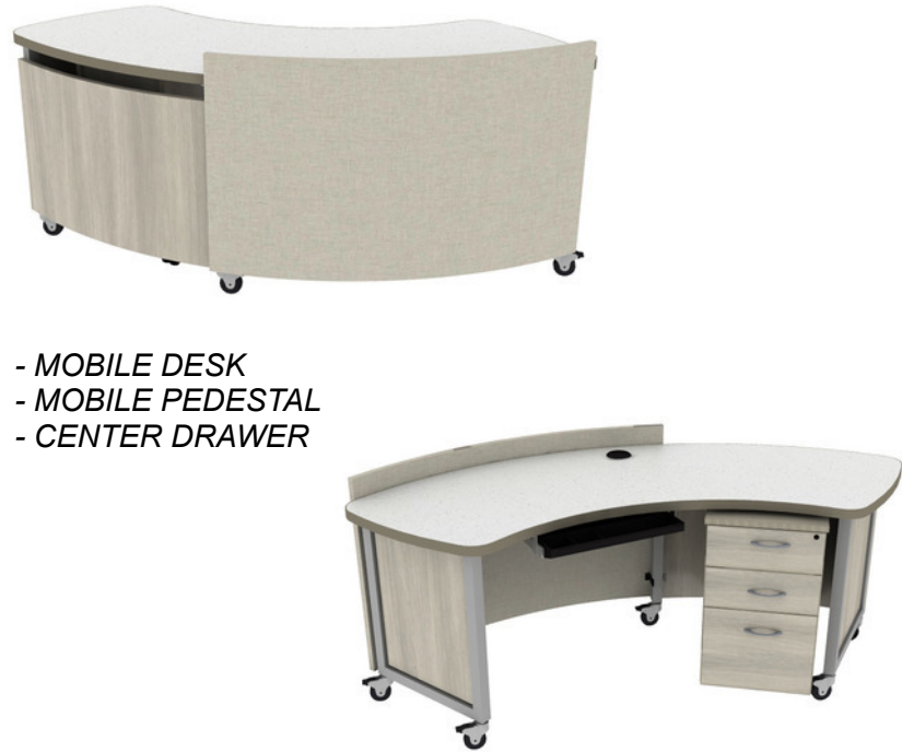
MOBILE BOOK RETURN NO SLOT BOOK TRUCK

Diagram showing the front elevation of the building with dimensions and labels: Overall width: 235" Overall height: 196" Horizontal dimensions (from left to right): 48" (ST-2) 48" (WS-1) 48" (ST-1) 48" (ST-1) 20" (SH-1) 19" (SH-2) Labels for structural elements: ST-2, WS-1, ST-1, ST-1, SH-1, SH-2 HW-3, HW-2, HW-1, HW-2, HW-4, HW-2, HW-4, HW-2, HW-3 GYP WALL