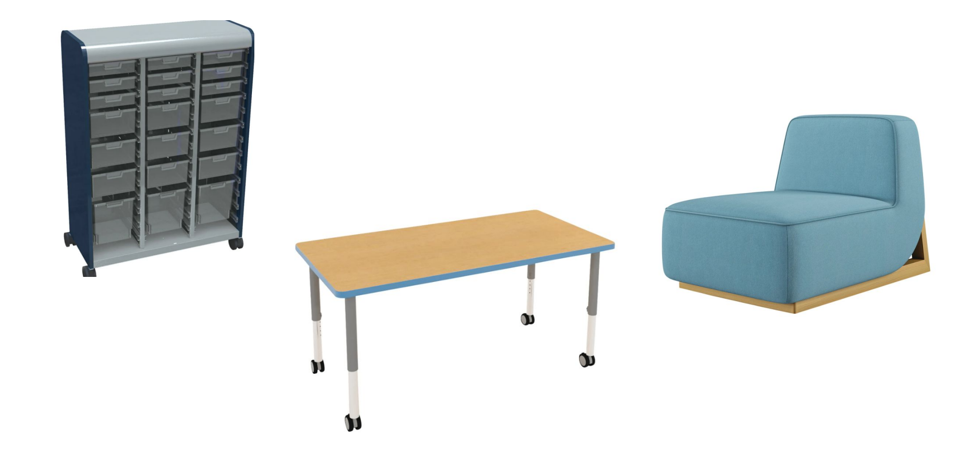
4th Grade Alcove