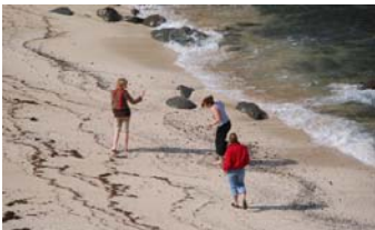
Art Council Members taking a stroll on the beach