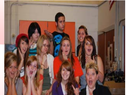
Art Council Group Picture

Chalk Art- During October 4th and 5th, HV Art students participated in Art Along the Rogue with their drawing of a Norman Rockwell painting which message says: "Hope for the poor. Achievement for yourself. Greatness for your nation."