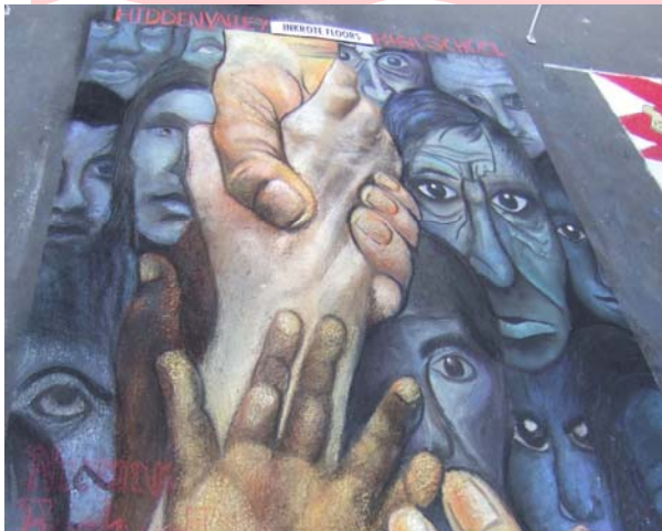
Hidden Valley Chalk Art Sponsored by Inkrote Floors