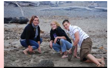
Art Council Members making sand sculptures