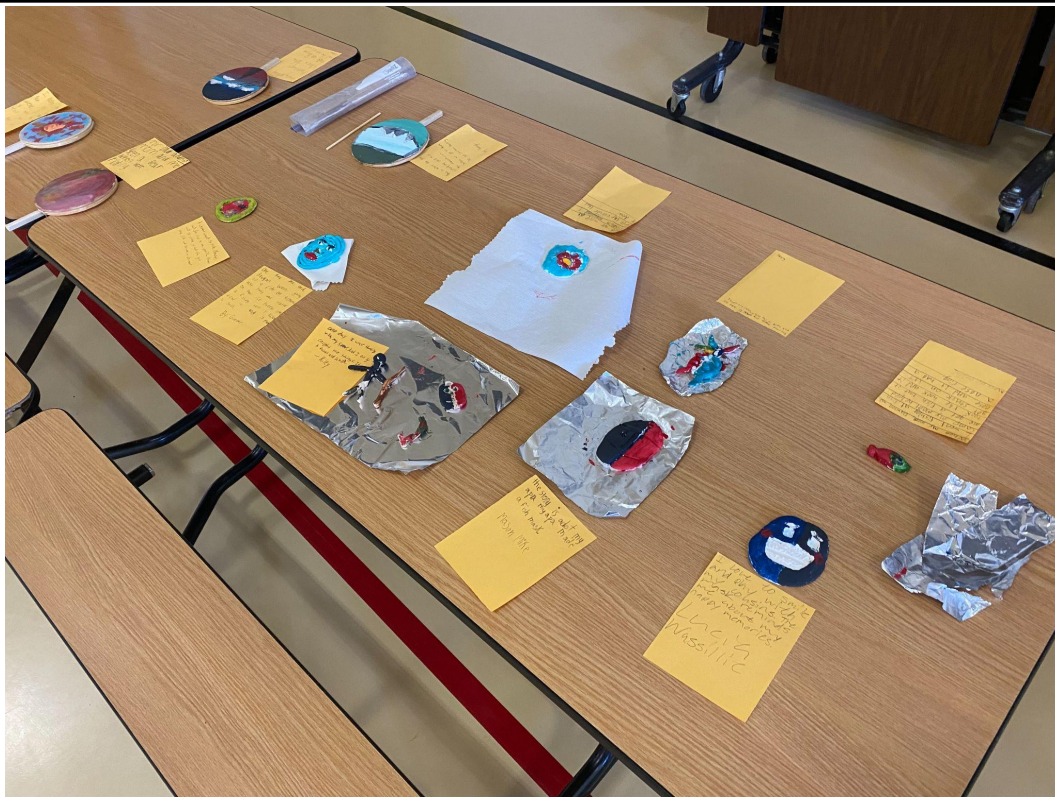
Masks with the stories behind them