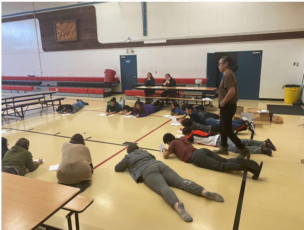
Drawing class with the big kids