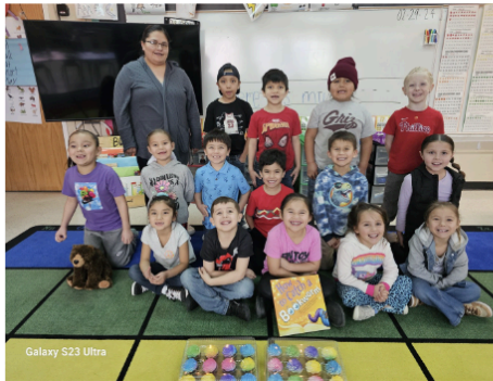
Ms. Shooter's Class Wins Cupcakes/Dedicated Classroom Book