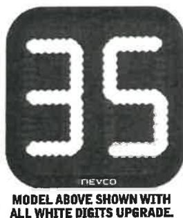
MODEL ABOVE SHOWN WITH ALL WHITE DIGITS UPGRADE.