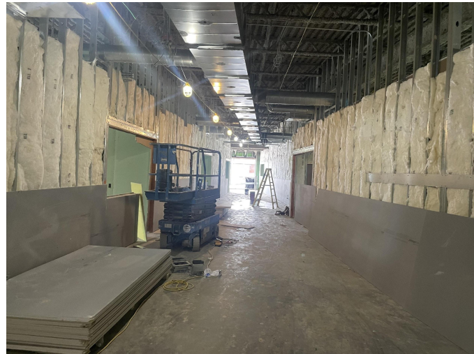
2-side drywall in Area A