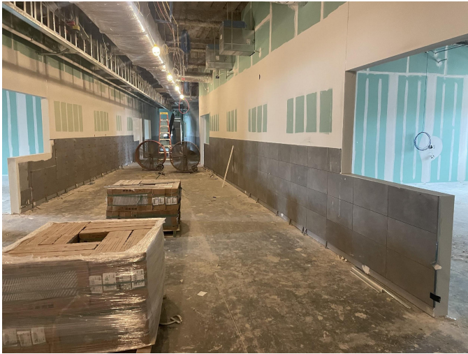
Ceramic Tile in Area D