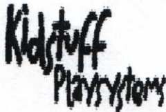
image003.jpg 2 KB

800-255-0153 Toll Free 219-938-3331 Ofc. 219-938-3340 Fax laura@kidstuffplaysystems.com