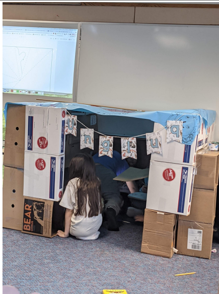
Designing and building a box fort is always a favorite.