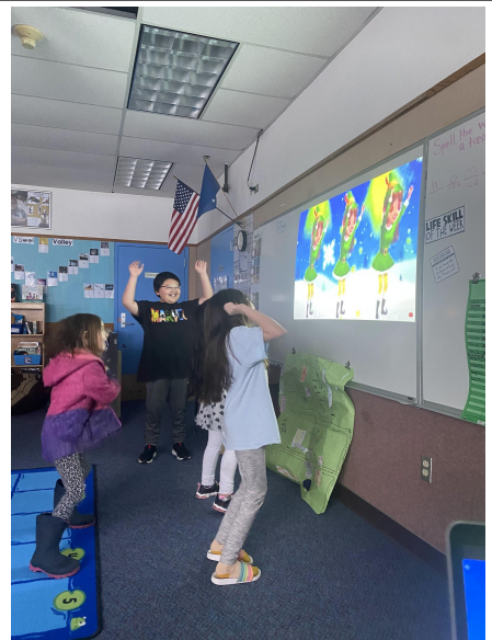
Dance Party to get the Wiggles and Giggles out is a must