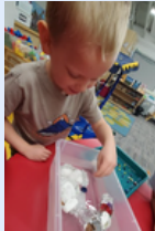
Will it Sink or Float?