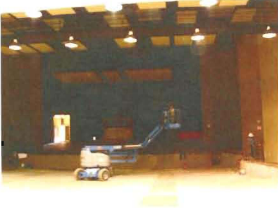
Painting in auditorium

This project is on schedule and on budget.