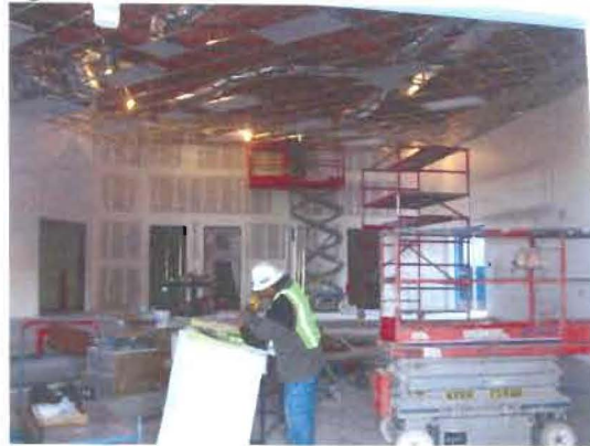
Interior Fine Arts