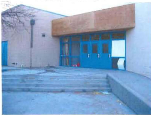
New north entrance to MPR