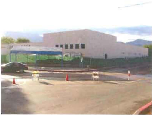
Exterior Fine Arts

This project is currently on schedule and on budget.