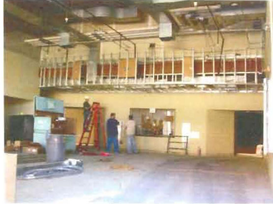
Lobby framing and rough electric

E. Nash Elementary Classroom Addition : Programming of the classroom addition at Nash Elementary is continuing. Construction documents are due to the district December 16 th . Permitting and final pricing for a construction contract will take place at that time.