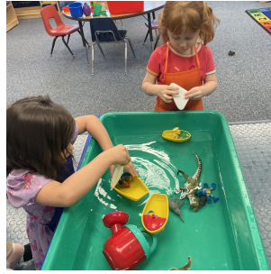
Chignik Lagoon Does it Float or Sink?