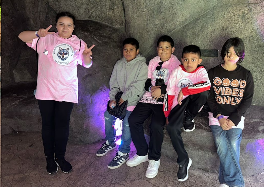
The 5th Grade Field Trip: