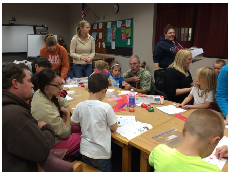
Evening Literacy Family Event