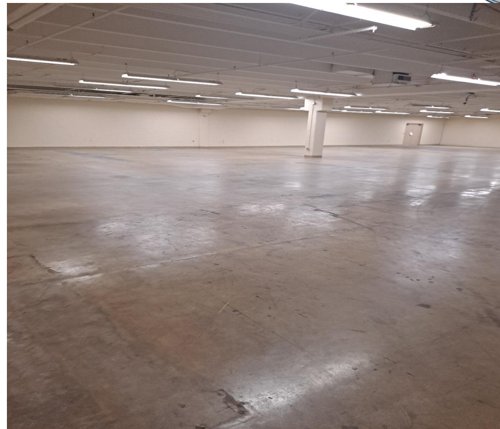
Open area - unwaxed