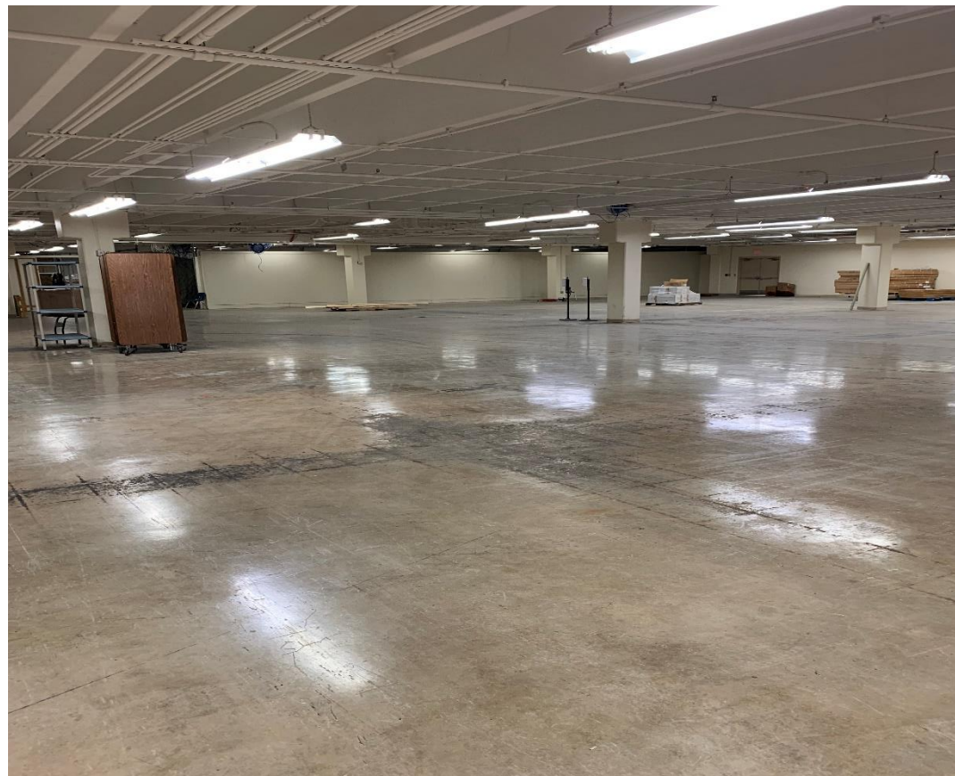
Open area - unwaxed