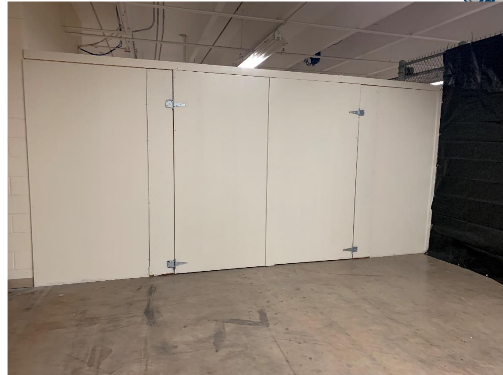
Temporary pass through doors for Child Nutrition