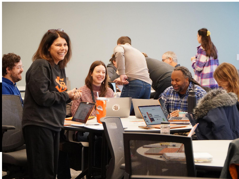
Districtwide Professional Development Day