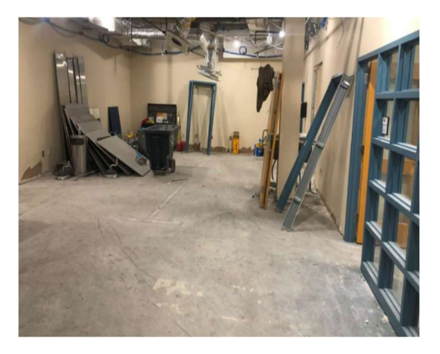
1<sup>st</sup> Floor Demolition in the PD Area