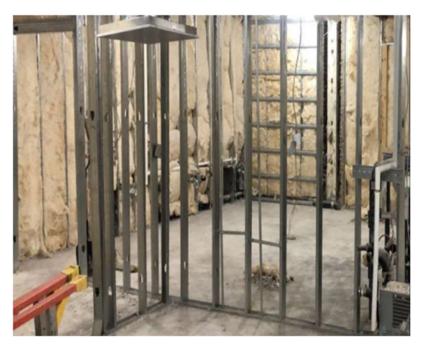
Demolition in Area F for New PD Area