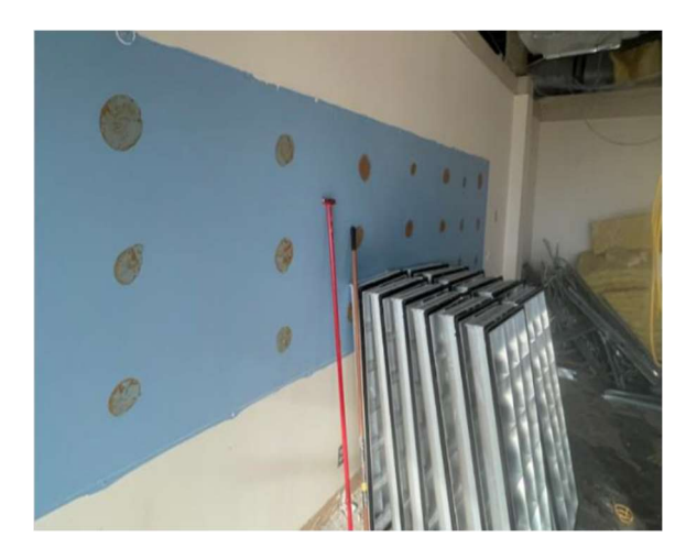
Stacked Existing Fixtures