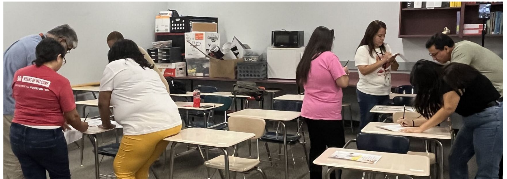
MAT Students in Class