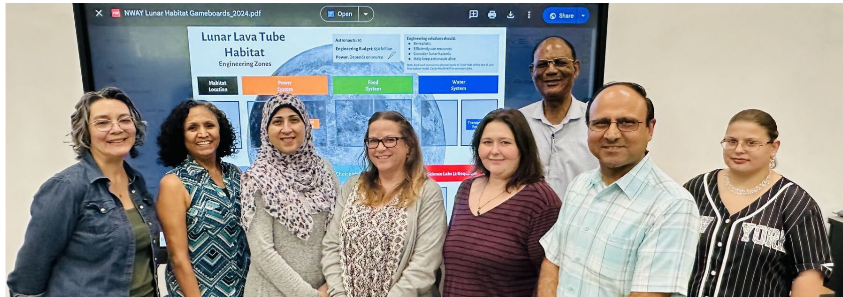
EDCI Cohort 11 Students

This US Department of Education grant seeks to expand access to postsecondary education for Houston's growing population of low-income and minority residents by fostering a supportive and successful community for graduate students in the College of Education.