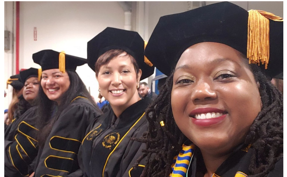
EDCI Students at Graduation