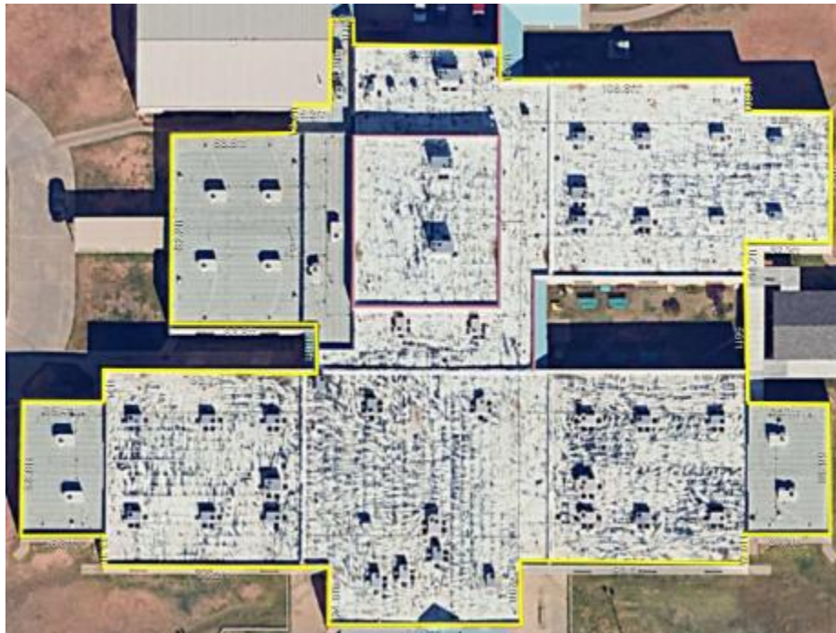
West Foundation Elementary School Wichita Falls, TX

Weatherproofing Technologies, Inc. (WTI), an affiliate of Tremco CPG Inc, is pleased to submit to Wichita Falls Independent School District (CLIENT) this proposal for a roof restoration located at 5220 Lake Wellington, Wichita Falls, TX 76310. We look forward to the possibility of working with you on this project.