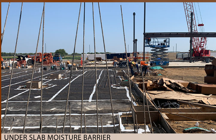
UNDER SLAB MOISTURE BARRIER