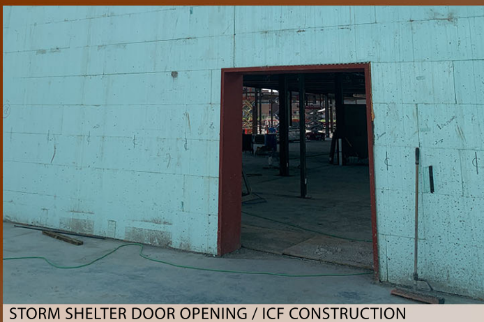
STORM SHELTER DOOR OPENING / ICF CONSTRUCTION