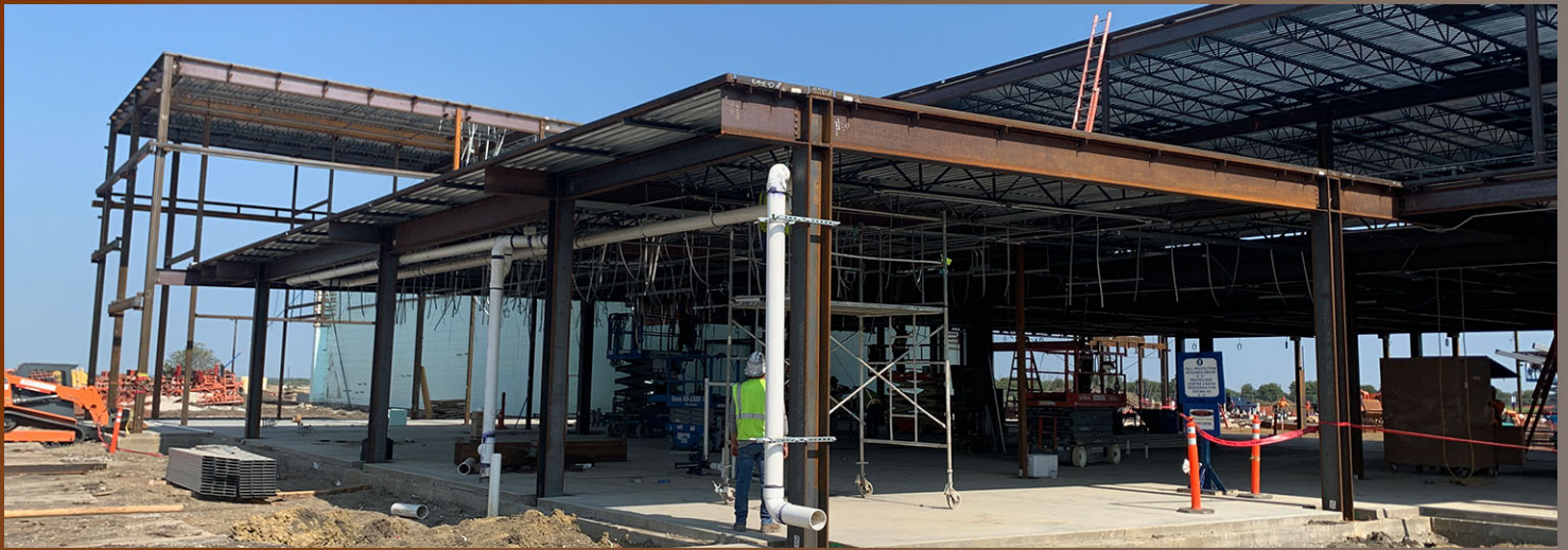
STEEL FRAMING AND ROOF DRAINS