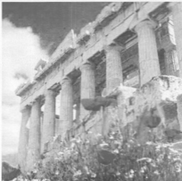
From St. Peter's Square to the Acropolis, history lessons abound around every corner in these two birthplaces of Western civilization.